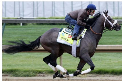
Oxbow and Gary Stevens

Trainer D. Wayne Lukas's Derby duo of Oxbow (Awesome Again) and Will Take Charge (Unbridled's