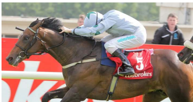
Sugar Boy

Of course, a slow start by a stallion is unlikely to go unpunished by breeders. Although Street Sense was re-directed to Darley's Japanese division, Darley have persevered with Authorized by keeping him at Dalham Hall. However, the son of Montjeu will have to cope with some smaller crops in a year or two, and his fee this year--£7,000--is less than a third of the fees he commanded during his first two seasons (the first spent in England at £25,000, the second in Ireland at €25,000).