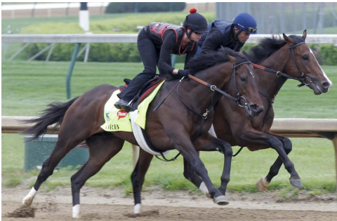
Orb (outside) works with Overwhelming Reed Palmer