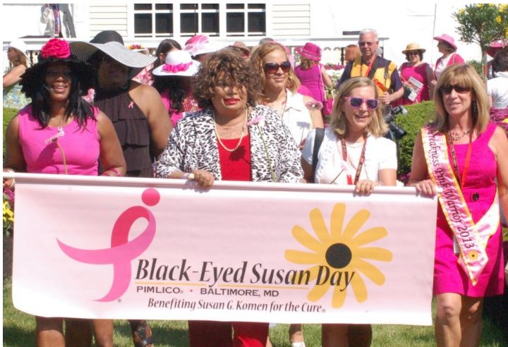
Survivors: Susan G. Komen for the Cure