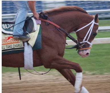
Will Take Charge Sherackatthetrack

Will Take Charge, hero of the Smarty Jones S. at Oaklawn Jan. 21, punched his ticket to Louisville with a hard-charging win over stablemate Oxbow (Awesome Again) in the GII Rebel S. in Hot Springs Mar. 16 ( video ).