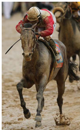
Orb Splashes Home in Derby