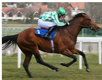
Declarations of War