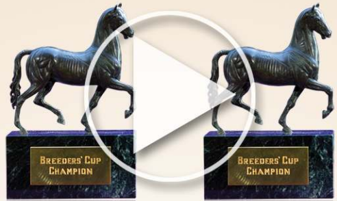
BREEDERS' CUP TURF SPRINT WINNER MIZDIRECTION