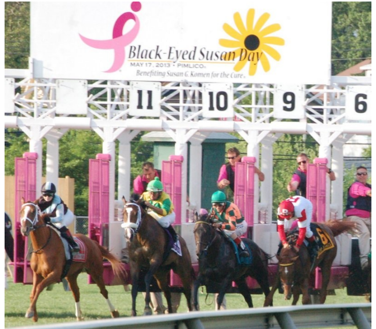
Emotional Kitten (inside) overcomes stumbling start in the Hilltop S.