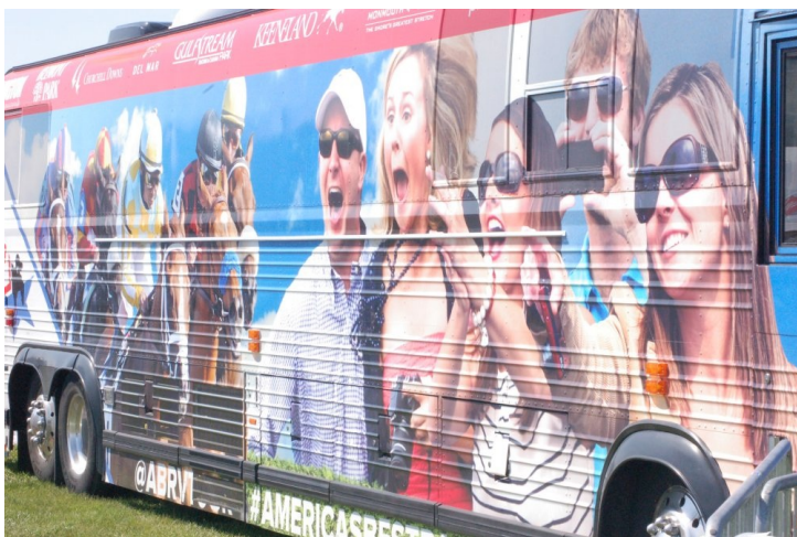
America's Best Racing promotional tour rolls through Baltimore