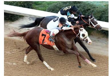
Will Take Charge