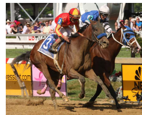
Fiftyshadesofhay (outside)