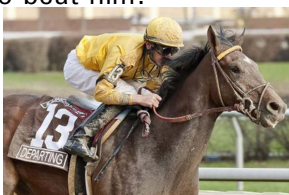
Departing FourFooted Fotos