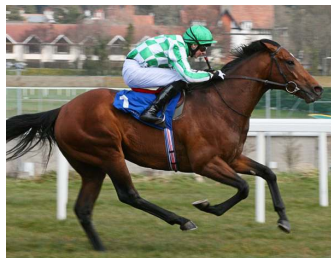
Declarations of War Racing Post

Before a big day of racing Stateside, Declarations of War (War Front) headlines a field of 13 in Newbury's G1 Locking S... The GII Dixie S. for older turfers attracted a full field on the Preakness undercard, which also includes six other added-money events... Glorious View (Pleasant Tap) looks to continue her hot hand in Belmont's GII Vagrancy H., More Chocolate (Malibu Moon) returns off short rest in the GII Marjorie L. Everett H. and Mezzano (Mizzen Mast) makes his stakes debut in Monmouth's GIII Red Bank S.