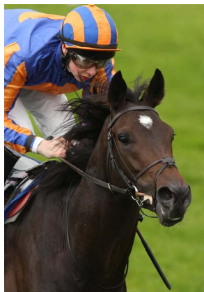
Magician (Ire)

Aidan O'Brien yesterday declared four of the original eight entries for tomorrow's G1 Tattersalls Irish 2000 Guineas, with Joseph O'Brien booked to ride Magician (Ire) (Galileo {Ire}) as the stable chase a ninth edition.