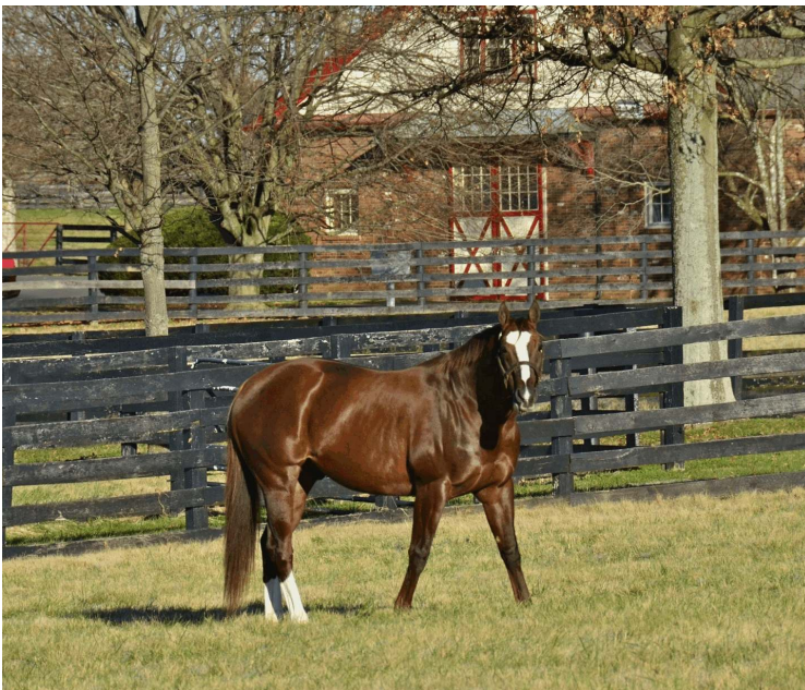
Kitten's Joy at Ramsey Farm