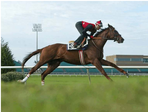
Kitten's Joy