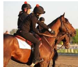
Orb