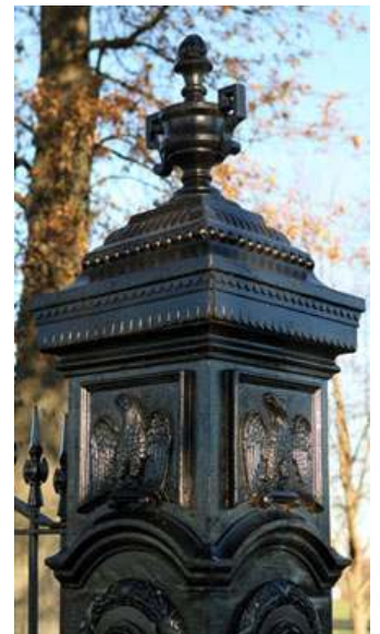
Ramsey Farm Entrance