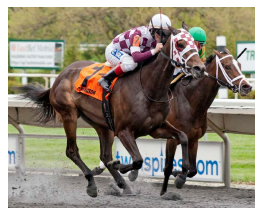
Imposing Grace Four Footed Fotos

Imposing Grace, a maiden winner over this track last summer, was runner-up in a pair of stakes at Fair Grounds over the winter and was never a threat while checking in sixth in the May 3 GII La Troienne S. The dark bay filly chased pacesetter Lotta Lovin through fractions of :24.83, :49.38 and 1:13.67. She pulled even with the pacesetter at the top of the stretch and those two battled stride for stride before Imposing Grace began opening up in the dying strides to hold the late-closing Sisterhood (Kitten's Joy) at bay. "I wasn't expecting to be so close to the pace, but she broke well and was sitting extremely comfortable on the backstretch," said winning rider Channing Hill. "She gave me all the confidence in the world picking it up at the eighth pole. When she got her head in front, she got to playing around a little bit."