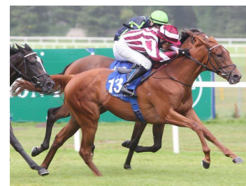
What Style

Of Aidan O’Brien’s trio, Just Pretending (Giant’s Causeway) could be one with the most to offer having made rapid progress in a hood, and she showed when winning the G3 Derrinstown Stud 1000 Guineas Trial at Leopardstown last time May 12 that she possesses the fight for this type of race.