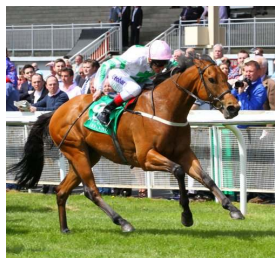
Hitchens Racing Post

After the withdrawal of Maarek (GB) (Pivotal {GB}), this sprint had a wide-open feel to it and it was left to Hitchens to edge out his rivals and claim a second renewal to his record. Following his first Pattern-race success in this in 2011 with a game fourth 12 months ago, the bay returned on the back of a fruitless spell in Dubai and in his native Britain. Close up behind the stand's-side pace traveling strongly throughout the early stages, he found a gap to enter