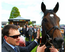
Magician & Aidan O'Brien

One of O'Brien's slow-burners at two, Magician took three starts to get off the mark, but when it came over this track and trip in October, it was delivered in impressive manner by 6 1/2 lengths. Unable to back up that performance when fading into last in the seven-furlong G3 Killavullan S. at Leopardstown 13 days later, he re-emerged at Chester a wildly contrasting proposition and won the Dee S. with authority to suggest that Epsom could be in the cards. Instead, connections headed back here for a drop in trip, and the bay showed why, traveling with consummate ease off the hard tempo set by Trading Leather. Moving smoothly to that rival with all others struggling behind, he employed his stamina from the furlong marker home and the contest was over bar the shouting.