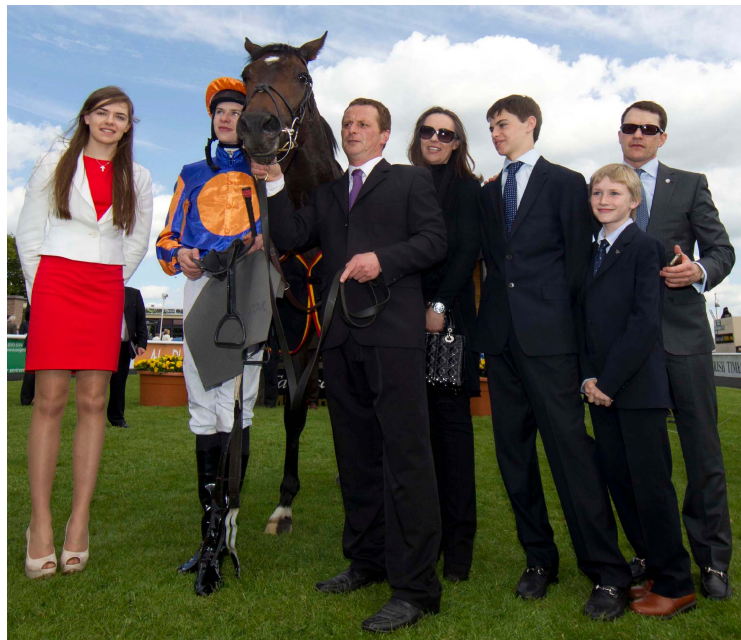
Winning Connections

“He’s very exciting. The lads are very tactically astute and will decide where he goes, but I’d imagine we might wait a bit with him. We’ll see how the horse is.” Van Der Neer (GB) (Dutch Art {GB}) was sent off the 5-2 favorite, but never looked likely to replicate his third placing in Newmarket’s G1 2000 Guineas and trailed in eighth.