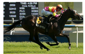
Solid Appeal