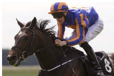
Magician and Joseph O'Brien