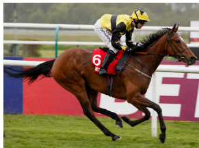
Secret Gesture