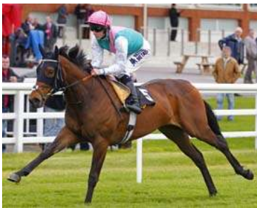
Joyeuse