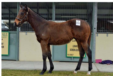
Lot 290

The results of the sale may well signal a further upward shift in the market to match recent yearling sales. Pending increases in stakes for racing in New South Wales have been well flagged, and recently both South Australia and West Australia have reported on their stakes increases, as they maintain the necessary parity with the Eastern States.