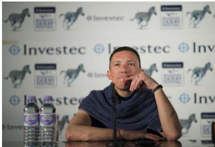
Frankie Dettori attends a press conference at Epsom yesterday

Dettori, who has just completed a six-month ban after he tested positive for cocaine while riding at Longchamp Sept. 16, was originally set to make his comeback on Monday, May 20, but this was delayed by France Galop for reasons which still have not been made public. The British Horseracing Authority finally reissued Dettori's licence Thursday, leaving him free to make his first