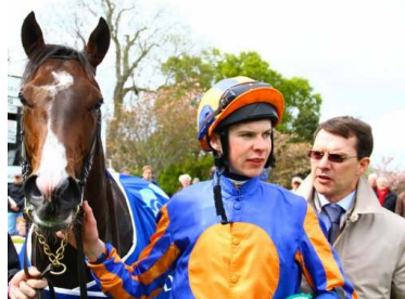
Battle of Marengo with Joseph & Aidan O'Brien

Ballydoyle are used to sending multiple runners to this race in recent times, but that policy has had limited success and it tends to be when the operation has a stand-out contender that they win this. They tried the scattergun approach against Sea the Stars in 2009 and choose that tactic again here, with Battle of Marengo (Ire) (Galileo {Ire}) apparently heading the battalion. Admirably consistent whatever the ground, Michael Tabor's colorbearer took the G2 Beresford S.