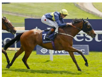
Thistle Bird (GB) Racing Post

After wins in the Listed Midsummer S. over an extended mile at Windsor in June and Listed Valiant S. at Ascot the following month, Thistle Bird ran second in the G2 Celebration Mile at Goodwood in August before