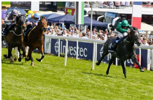
Gregorian (Ire) (Clodovil {Ire}) runs away with Friday's G3 Diomed S. Racing Post