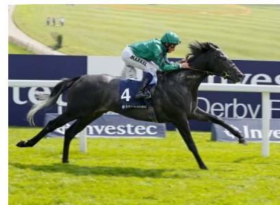
Gregorian (Ire)

was reluctant to commit to a showdown with Animal Kingdom (Leroidesanimaux {Brz}) in the G1 Queen Anne S. at Royal Ascot June 18. "I think the fact that Animal Kingdom is here is extraordinary and it would be fantastic to run against him, but we would require rainfall," he said. "Someone's got to finish second, third or fourth."