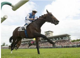
Intello victorious in the Prix du Jockey Club