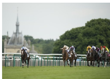
Intello strides away from the field

Brought along steadily by Andre Fabre at two, Intello was restricted to a pair of mile conditions races at Longchamp in September and at Maisons-Laffitte the following month and emerged with a perfect record without being asked a serious question.