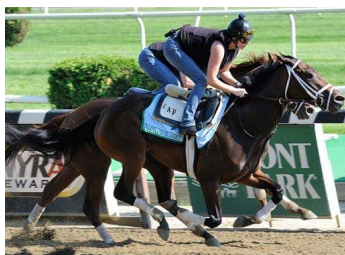
Unlimited Budget A Coglianesi