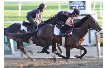
Orb