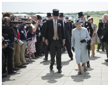
The Queen arrives at Epsom