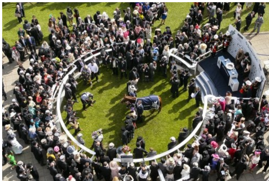
Investec Derby winner Ruler of the World in the winner's circle