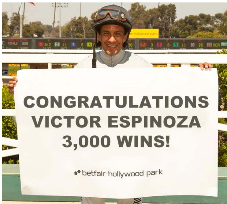
Jockey Victor Espinoza wins his 3,000th race aboard Flashy Delight in the fourth race at Betfair Hollywood Park Friday.