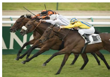
Now We Can (center) gets up to win Racing Post

Unbeaten since his debut defeat at Longchamp last May, Now We Can earned a tilt at black-type with a six-length conditions win over 14 1/2 furlongs on his seasonal bow on the Polytrack here Mar. 22. Proving up to the test by annexing the Listed Prix Lord Seymour