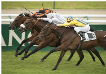
Now We Can (center) gets up to win Racing Post

Also on the French Derby card, Spirit Quartz (Ire) (Invincible Spirit {Ire}) won the G2 Prix du Gros-Chene and Peace Burg (Fr) (Sageburg {Ire}) won the G2 Prix de Sandringham.