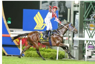
Lucky Nine