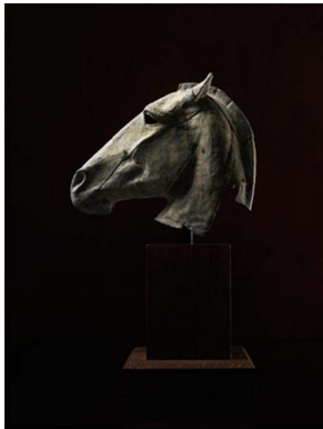
Earle Mack TRF Champion Award

Also on Thursday night, chef and racehorse owner Bobby Flay will receive the Earle I. Mack Thoroughbred Champion Award, annually given to an individual for