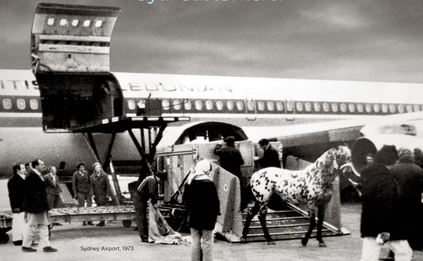
Sydney Airport, 1973

A journey best measured in countless miles and loyal customers.