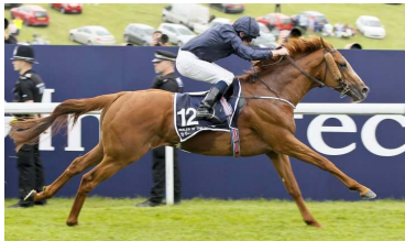
Ruler of the World

There were three Classics last weekend: the G1 Epsom Oaks on Friday; the G1 Epsom Derby on Saturday; and the G1 Prix du Jockey-Club French Derby on Sunday. In those three races, 12 horses, of course, filled the first four places. Six of the 12 places were filled by 3-year-old colts and fillies by Galileo. Two more were filled by first-crop 3-year-olds by Galileo's son, New Approach.