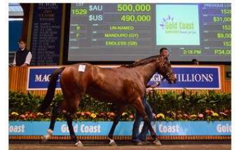
Lot 1529

A well-related filly by Manduro (Ger) from the Patinack Farm reduction realized a final bid of A$500,000 (US$481,845) to top the first session of the Magic Millions National Yearling Sale Tuesday on the Gold Coast. Catalogued as lot 1529 , the Oct. 14 foal is a daughter of Endless (GB) (Sadler’s Wells), a half-sister to MGI/GISW Powerscourt (GB) and half-sister to the dam of undefeated champion Frankel (GB). (Galileo {Ire}). Endless was part of the Patinack reduction as well and was sold at last week’s National Broodmare Sale to Sheikh Mohammed bin Khalifa al Maktoum for A$1.05 million. Patinack had acquired Endless for 105,000gns as a horse in training at Tattersalls December in 2009, then bred her to Manduro on Southern Hemisphere time in late 2010. Lot 1529 is her first foal. Magic Millions signed the winning ticket on lot 1529 on behalf of an undisclosed buyer. The session’s second most-expensive youngster, lot 1497 , also emerged from the Patinack reduction. A daughter of More Than Ready, the Sept. 9 foal is a daughter of the stakes-winning Danehill Smile (Aus) (Danehill Dancer {Ire}) and is bred on the same cross as Group 1 winners Sebring (Aus) (champion), Perfectly Ready (Aus) and Dreamaway (Aus). Magic Millions signed the winning ticket for lot 1497 as well on a bid of A$280,000 (US$269,552). Cont. p8