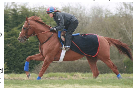
Animal Kingdom Ascot Diaries