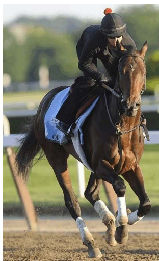
Morning line choice Orb

A total of 14 sophomores will go postward in Saturday's GI Belmont S. Chief among participants in the final jewel of the U.S. Triple Crown are GI Kentucky Derby hero Orb (Malibu Moon), who drew post five,