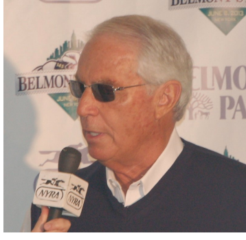
D. Wayne Lukas