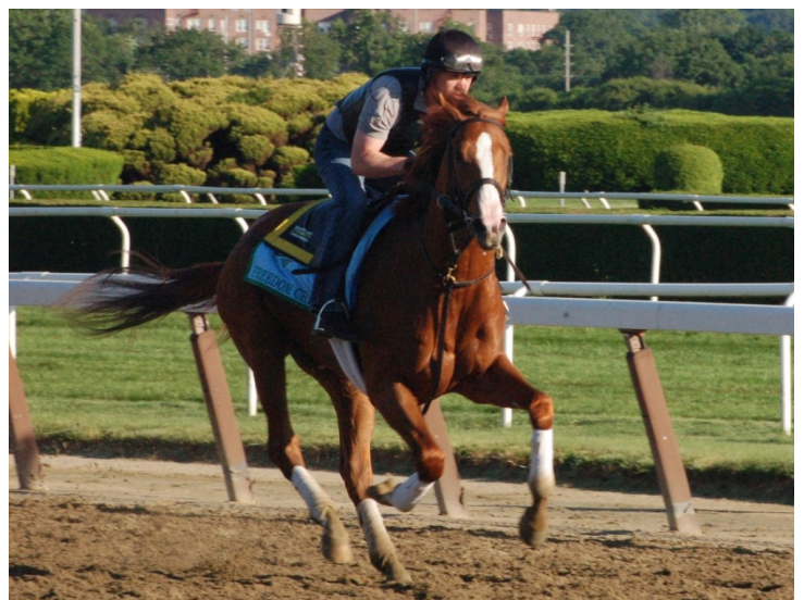
Freedom Child has thrived at Belmont Park since his runaway win in the GII Peter Pan S.