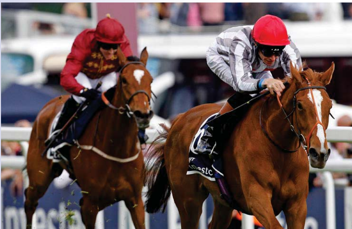
RUNNING ON SARACEN RACE 13