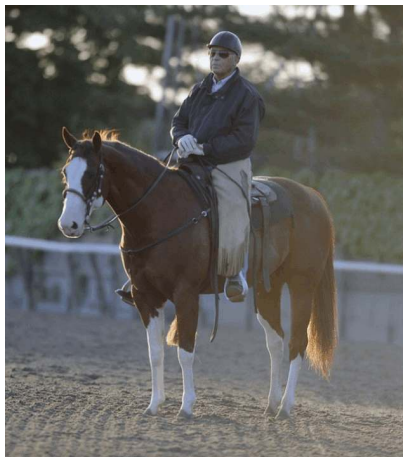
D. Wayne Lukas