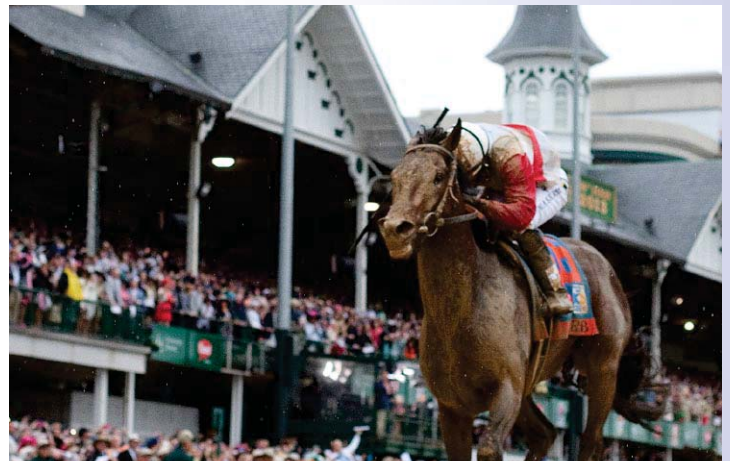
RUNNING ON HALLWAY FEEDS RACE 13