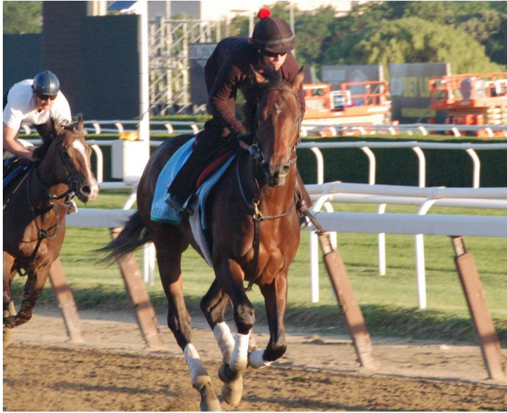
Kentucky Derby winner Orb in action shortly after 6 a.m. Wednesday