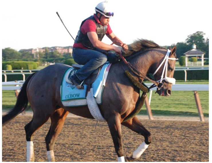
Preakness winner Oxbow always makes a favorable impression during training hours