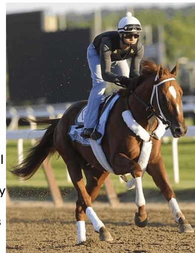
Golden Soul