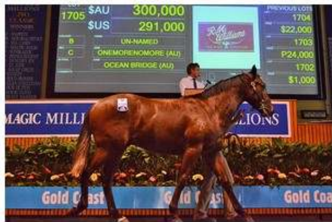
Lot 1705 Magic Millions photo