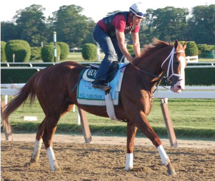
Will Take Charge looks to bounce back in the Belmont following a disappointing run in Baltimore