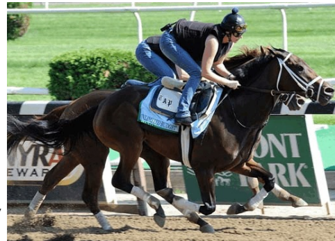
Unlimited Budget