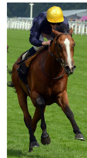
Hillstar Racing Post