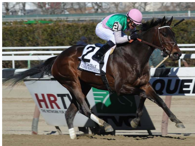
Close Hatches David Alcosser

Saturday, Belmont Park, post time: 5:49 p.m. EDT MOTHER GOOSE S.-G1, $300,000, 3yo, f, 1 1/16m