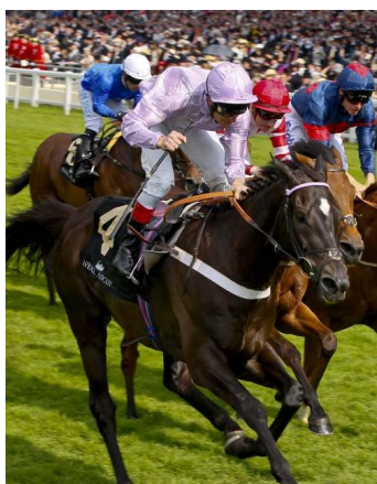
Forgotten Voice