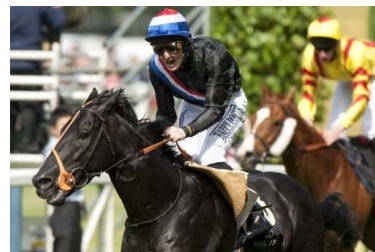
Society Rock wins the 2011 Golden Jubilee