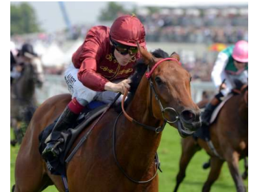
Kiyoshi Racing Post

18, the bay moved forward to win a decent contest over an extra panel at Goodwood last time May 23 and, despite attracting money in this market, was expected to play second fiddle to the heavily backed Sandiva. Held back in last early by Jamie Spencer after breaking from the