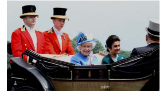
The Queen and Princess El Hassan

Bred by The Queen, they are all backed and trained by the royal grooms. As the procession of empty carriages wind their way down the road, a ripple of excitement goes through the crowd. The long wait is now almost over. Then, the newcomers to the changeover utter sighs of dismay as they notice the covers on all the carriages. By now an expert on these royal carriages, after my day in car park one, I readily assure them that the covers are only up when traveling empty and are sure to come down before The Queen arrives. Spots on the rope are sacred places and jealously guarded, yet as the waiting crowd catch a glimpse of a long line of black cars