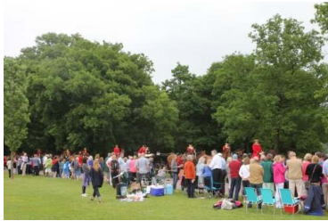
Crowd gathering in Great Windsor Park

I am lucky enough to be spending Royal Ascot week in a lovely cottage in Windsor Great Park. Surrounded by giant trees, it is a very peaceful place. Pheasants and deer dot the lawn at dusk and dawn, while the constant chatter of birds fills the air. Peaceful indeed--except for 11 a.m. to 2 p.m. every day of Royal Ascot week.