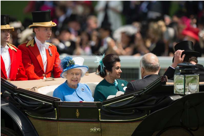
The Queen arrives Friday