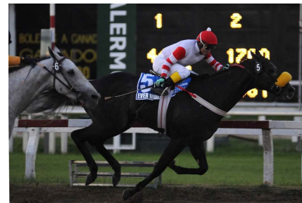
Ever Rider Hipodromo Argentino de Palermo