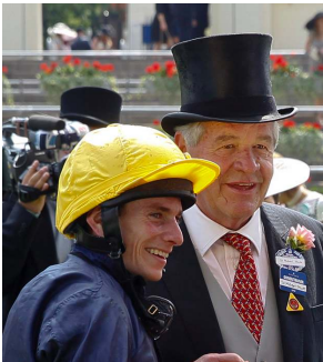
Ryan Moore & Sir Michael Stoute