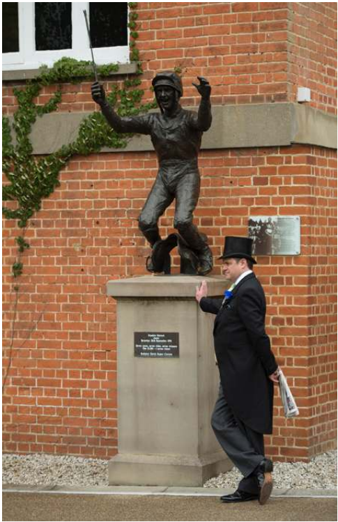
Posing with Frankie Dettori Statue