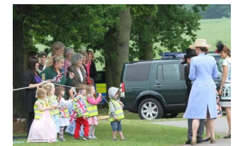
Princesses and Princesses in the making

After the cars carrying her guests have safely departed, The Queen's car draws up next to her carriage. This is the moment the crowd have been waiting for. There is a great sigh of admiration as she graciously exits the car, pauses for a moment or two, giving the crowd a chance to snap that precious picture, before getting into the carriage. For the unlucky ones who could not get close enough, the carriages depart at a gentle walk, giving the rest of those assembled a chance to get a quick snap with that handy iPhone. Then the leading postilions give the signal with their whips, the Windsor Greys smartly accelerate into a trot and the procession heads down towards Ascot gate. The entire length of the route is lined with spectators, big and small. Near the end of the ropes a small group of children dressed as princesses under their bright yellow safety vests, furiously wave their Union Jacks as The Queen goes by. At Ascot Gate, an old man, properly dressed in black suit and tie, sits in a wheelchair. He has been there for a couple of hours already, but the smile on his face as The Queen passes by is priceless. It may not have the pomp and circumstance of the Royal Procession down the hallowed Ascot turf, but there is an endearing realness to the people gathered here, under the trees in a royal park, to pay homage to their Queen.