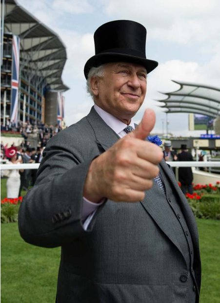
Sir Evelyn de Rothschild after the G2 King Edward VII S.