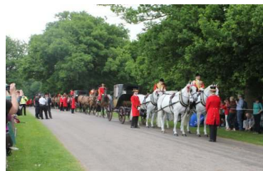
Windsor Greys waiting for The Queen

The carriage horses are usually stabled in the Royal Mews at Buckingham Palace, but for Royal Ascot week, they reside in the Royal Mews at Windsor Castle. The four-in-hand team pulling the Queen's Ascot landau is made up of the famous Windsor Greys. A mixture of Irish Draught, they are usually 16.1 hands high and are chosen for their steady temperament and stamina, while the other four-in-hand teams are Cleveland Bays.