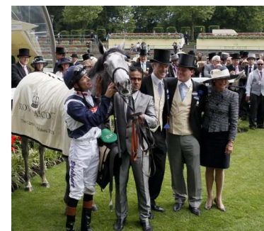
The winning connections celebrate Racing Post