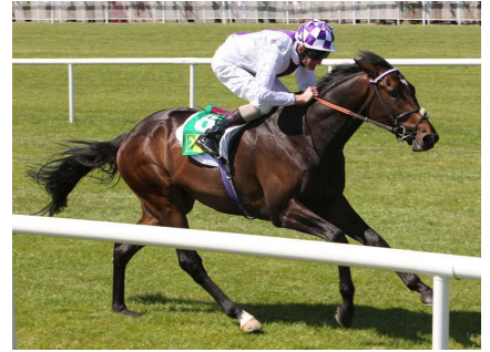
Trading Leather