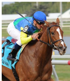
Dayatthespa

Dayatthespa (City Zip), heroine of last term's GI Queen Elizabeth II Challenge Cup S. at Keeneland