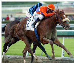
Jimmy Creed

A berth to the GI Breeders' Cup Sprint will be on the line in today's "Win and You're In" GI Triple Bend H. at Betfair Hollywood Park. The well-bred Jimmy Creed (Distorted Humor), ninth in last year's Sprint, has been perfect since. The 4-year-old got the money in the prestigious GI Malibu S. at Santa Anita Dec. 26, then delivered a narrow victory in the GII Potrero Grande S. last time Apr. 6. He has been working up a storm in the a.m., including a three-furlong blowout in :35.20 at Santa Anita June 27. Comma to the Top (Bwana Charlie), a game winner in Aqueduct's GIII Tom Fool H. Mar. 2, faded to fourth in the Potrero Grande, but has been unstoppable in two subsequent tries. He annexed the Cool Frenchy S. over this course May 4, then earned a gaudy 109 Beyer Speed Figure in the GIII Los Angeles H. last time May 27. Triple Bend defending champ Camp Victory (Forest Camp) has gone winless in five subsequent starts, most recently completing the trifecta in the Los Angeles.