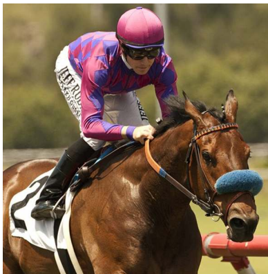
Obviously