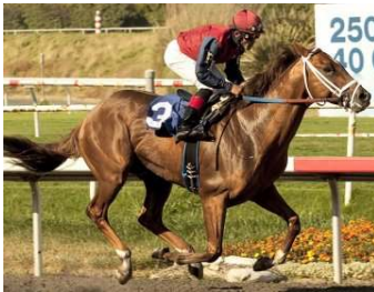
Smiling Tiger