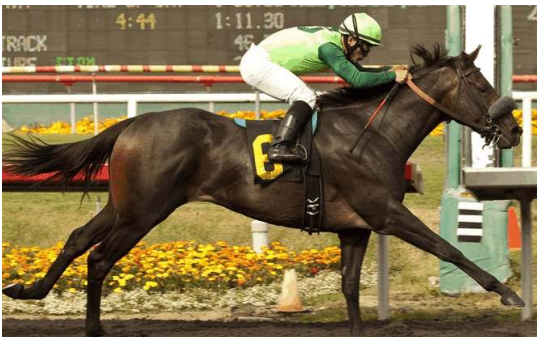
Tiz A Minister

Only four sophomores line up for today's GII Swaps S. at Betfair Hollywood Park, but included among them is a Grade I winner in the form of Charles Fipke's