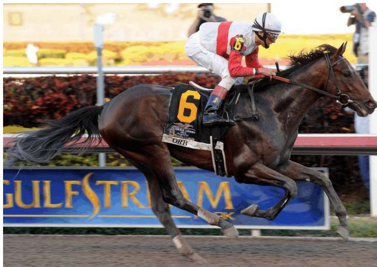
Kentucky Derby victor Orb taking GI Florida Derby this winter