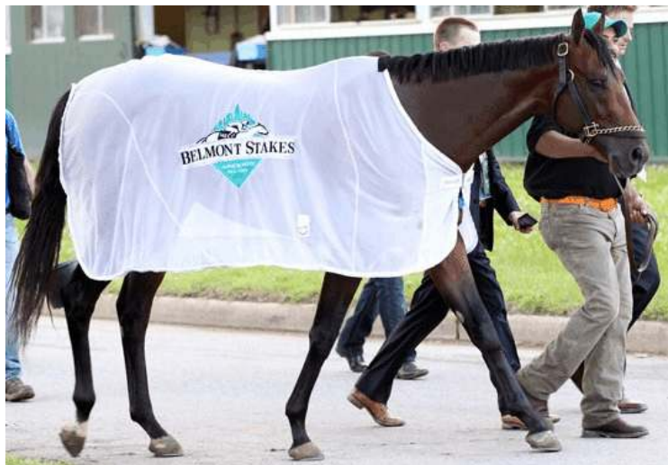
GI Belmont winner Palace Malice