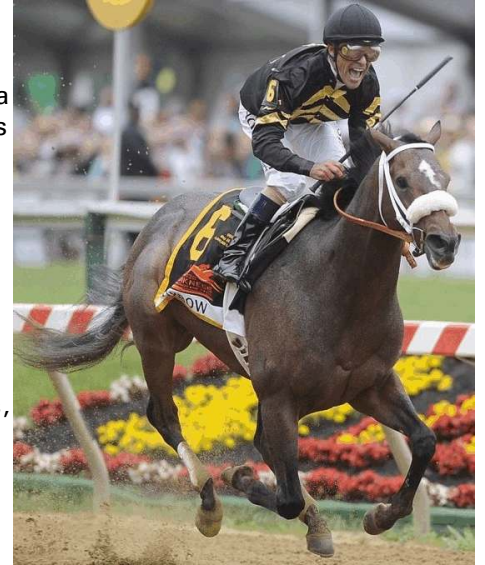
GI Preakness hero Oxbow