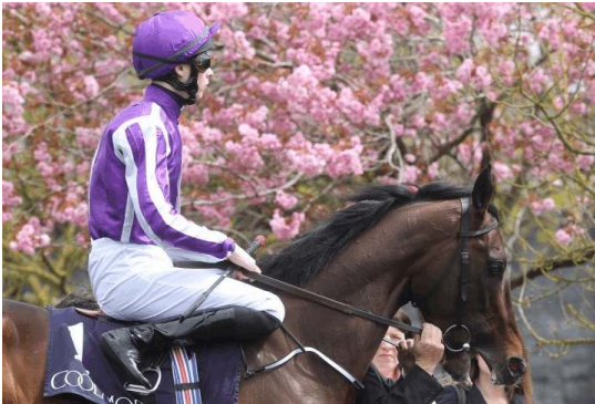
Camelot (GB)

Camelot (GB) (Montjeu {Ire}) will miss Saturday's G1 Coral-Eclipse at Sandown, with connections giving the triple Classic hero a break. While last year's 2000 Guineas and English and Irish Derby winner will not represent Coolmore in the 10-furlong feature, it is likely that the operation will be double-handed with the June 18 G1 Queen Anne S.