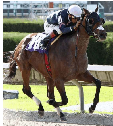
Starship Truffles

Gainesway’s Michael Hernon agreed the market is gaining strength.