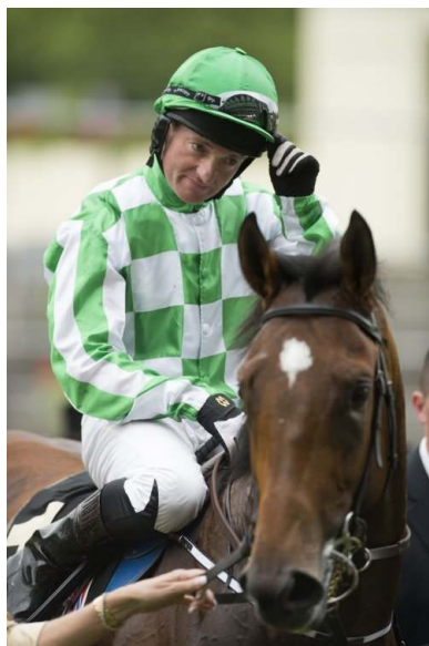
War Command Racing Post

War Command (War Front), who was so impressive in the G2 Coventry S., is being aimed at the G1 Keeneland Phoenix S. at The Curragh, trainer Aidan O'Brien announced yesterday. Carrying breeder Joseph Allen's colors to a six-length success in the June 19 Royal Ascot contest, the colt will stay at six furlongs for the Aug. 11 highlight. "We're training War Command with the Phoenix S. in mind--that will be the plan if we're happy with him closer to the time." Page 9