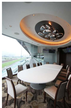
A private owners' room at Sha Tin

BN: An owner must be a Club member. He or she is limited to a maximum of four horses as either a sole owner or in a partnership, as demand far exceeds supply. A ballot is conducted once a year in June to determine which members will be awarded a permit to import a horse. There are about 1,100 applications chasing 330 permits. To be a horse owner in Hong Kong carries a recognition of prestige and status that is very healthy to our business. There is no breeding in Hong Kong, so all horses are sourced and imported, about 70 percent from the southern hemisphere and the rest from the north. Most horses are Australian and New Zealand