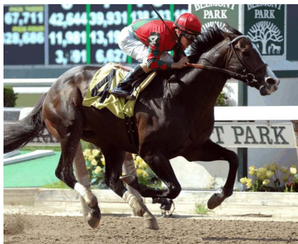
F-T July Grad Flat Out

After a spring chock full of record-setting juvenile auctions, the yearling sales season kicks off today in Lexington with Fasig-Tipton's July Sale. The one-day auction will be immediately followed by Fasig-Tipton's inaugural July Horses of Racing Age sale.