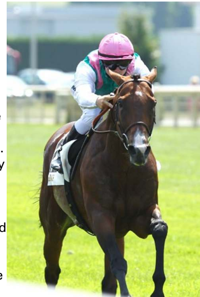
Dance Moves Scoop Dyga

Having opened his stakes account in September's Listed Prix de Boulogne at Longchamp, Dance Moves, a full brother to yesterday's G1 Grand Prix de Paris winner Flintshire (GB), closed last term with a fourth in the G2 Prix du Conseil de Paris back there Oct. 21, and occupied the same berth in the Listed Le Vase d'Argent at Toulouse on seasonal return Apr. 26. Juddmonte's homebred bay enjoyed odds-on favoritism here, coming back off a fifth in the June 2 G2 Grand Prix de Chantilly, and was steadied in rear off an early crawl. Making headway into fourth on the home turn, he came under pressure passing the quarter-mile marker and was driven out inside the final furlong to edge in front in the dying strides.