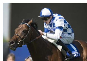
Al Kazeem