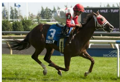
Surtsey

Surtsey got off the mark in her fourth outing last year over the Poly here against $32,000 taggers, and--after finishing third in a $30,000 claimer--sprang a mild upset when bagging the restricted Fanfreluche S. to wrap up her juvenile campaign Oct. 13. She finished a well-