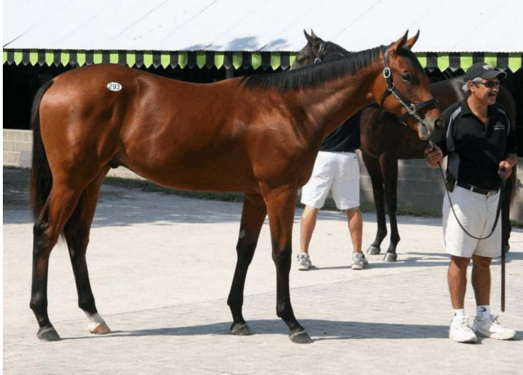
Midnight Aria as a yearling

Once through those early trials, the youngster advanced by leaps and bounds.