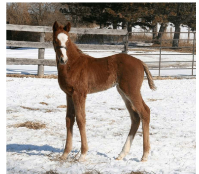
Surtsey as a foal

“And I like a younger mare. I want a mare that is big, strong and has lots of leg. I like her to have a little more scope. I like to see them have produced something in the past and that they can produce foals that are leggy, then that is great too. I also like a mare to look feminine.”