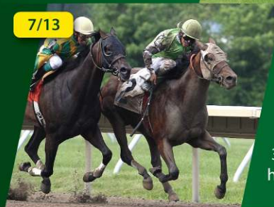
JAY EYE SEE (#2), 3yo c., a maiden winner at 2, he won at Monmouth on Sat.