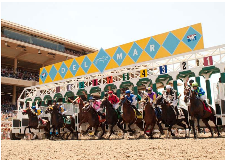
...And Away They Go at Del Mar!