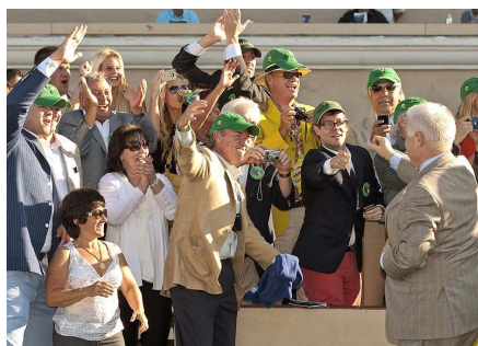
Team Donegal Celebrates Dullahan's win in the 2012 Pacific Classic

Donegal Racing's Dullahan (Even The Score), hero of the 2012 GI Pacific Classic over Game on Dude (Awesome Again), will be back to defend his title at Del Mar Aug. 25.