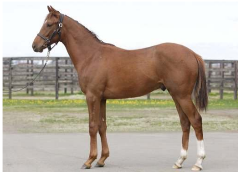
Lot 233 hba.or.jp