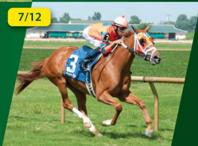
BARONESS ROSE, 2yo f. won off by 3 lengths in her debut.