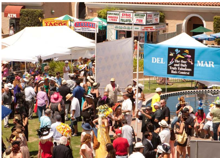
Making the Scene