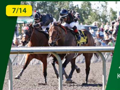
STOPSHOPPINGDEBBIE, 3yo f. now undefeated in 4 starts with victory in the Kent H.