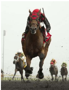
Midnight Aria winning the Queen's Plate