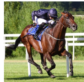
Geoffrey Chaucer Racing Post