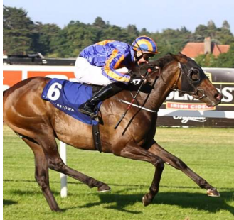
Wonderfully & Joseph O'Brien

Off the mark in a decent six-furlong maiden at Fairyhouse June 5, Wonderfully contested the red-hot G3 Albany S. at Royal Ascot June 21, and was not disgraced when seventh over what was probably an inadequate trip for her. Becoming the third also-ran