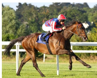
Royal Diamond Racing Post

Penalized for his Group 1 success in last year's Irish St Leger, Royal Diamond made light work of this task by making virtually all and dominating over-matched rivals. Tackled for the lead initially by his main market