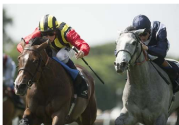
Elusive Kate (I) allowed to keep Falmouth

An appeal into the controversial decision by Newmarket stewards to allow Elusive Kate (Elusive Quality) to keep the victory in the G1 Falmouth S. was heard yesterday by the British Horseracing Authority. The body, citing the fact that “did not improve [her] placing by virtue of interference” of favored Sky Lantern (Ire) (Red Clubs {Ire}), refused to overturn the result and the appeal was dismissed.