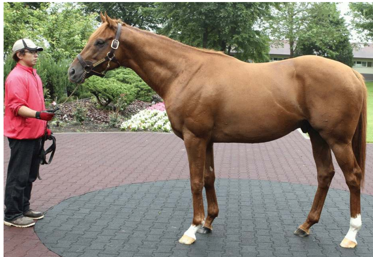
I'll Have Another