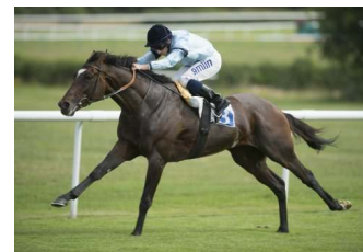
Telescope

O-Highclere Thoroughbred Racing (Wavertree); B-Barronstown Stud; T-Sir Michael Stoute.