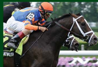
NY Bred Grad NOTACATBUTALLAMA-2013 GSW