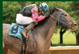
NY Bred Grad CAPELLADANCER-2013 SW