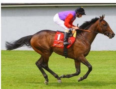
Carlton House Racing Post

Michelangelo (GB) (Galileo {Ire}), unraced since finishing third in last year's G1 St. Leger, brought up the rear of the seven horse field.