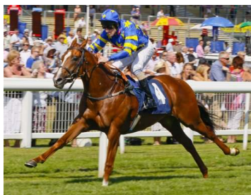
Miracle of Medinah Racing Post