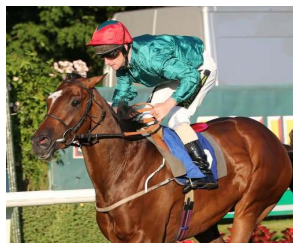
Maputo Racing Post