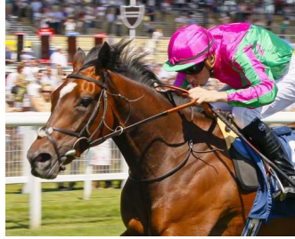
J Wonder Racing Post

+ J WONDER (f, 2, Footstepsinthesand {GB} -- Canterbury Lace, by Danehill ), who was scratched from her intended debut at Newmarket July 11, found cover in mid-division through halfway in this one. Hurried along just before the two pole, the 16-1 chance