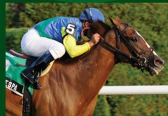
NY Bred Grad DAYATTHESPA-GI