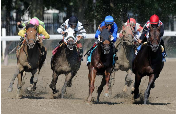
Horses charge into the GIII James Marvin S. with winner Sage Valley on the outside