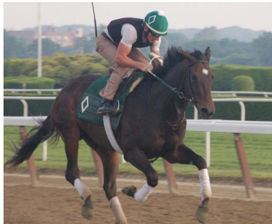
Royal Delta Sherackatthetrack