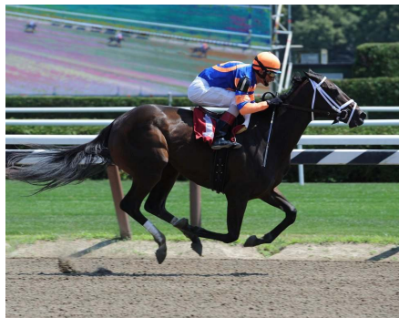
Stopchargingmaria Adam Coglianese

3rd-SAR, $80,000, Msw, 2yo, f, 5 1/2f, 1:04 3/5, ft. + STOPCHARGINGMARIA (f, 2, Tale of the Cat --Exotic Bloom {MSW & GSP, $257,281}, by Montbrook) worked a strong four furlongs in :47 3/5 at Saratoga July 13, and was supported as the 1-2 chalk for last