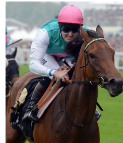
Riposte & Queally