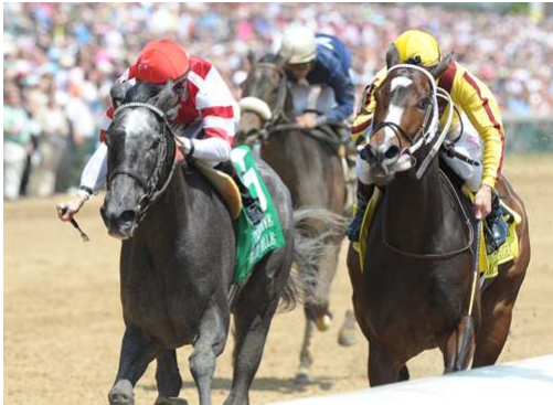
Unrivaled Belle (red cap) defeats Rachel Alexandra at Churchill

This season, Unbridled's Song has been represented by the brilliant Graydar, whose four victories from five