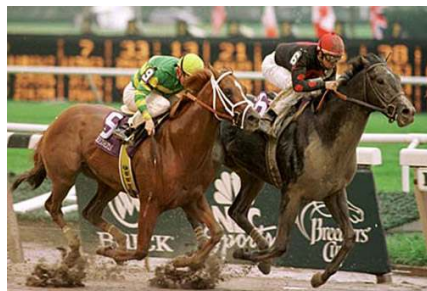
Unbridled's Song (rail) wins '95 BC Juvenile