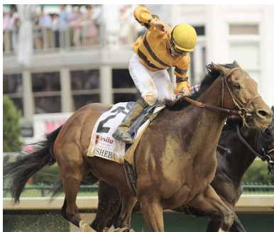
Successful Dan