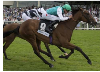
Lilyfire Racing Post

Ascot, 14.00, Mdn, £10,000, 2yo, f, 7fT, 1:29.37, gd. + LILYFIRE (f, 2, First Defence --Didina {GB} {MGSW & GISP-US & SW-Eng, $201,368}, by Nashwan) recovered from a slightly awkward exit to race in the second rank through the early fractions. Stoked up