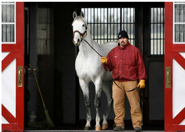
Unbridled's Song (1993-2013)