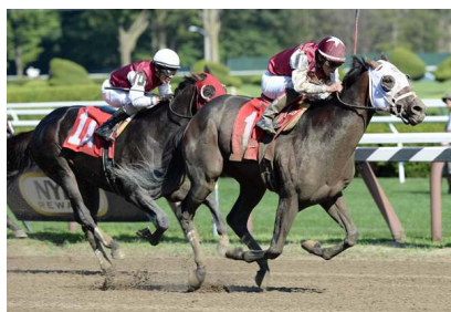
Transparent (maroon cap) passes official winner Romansh

Romansh graduated by 5 1/2 lengths in his third attempt last time out in an off-the turfer at Belmont May 25. Getting blinkers here and coupled with Transparent (Bernardini), Romansh stumbled at the start