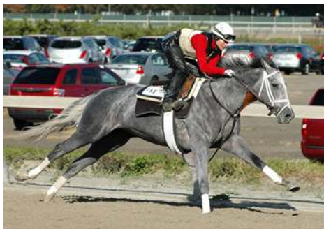
Multiple Grade I winner Octave at Belmont

The progeny of Unbridled's Song have been popular all along in North American auction rings. He has been represented by a total of 653 yearlings sold since 1999 for a gross of $198,148,540 and an average of $303,443. No fewer than 26 yearlings achieved seven-