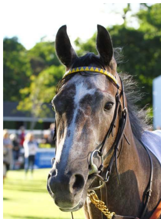
Tickled Pink

Sir Henry Cecil's presence is sorely missed at the Glorious Goodwood meeting he enjoyed so much over the years, and it is a Warren Place representative in Tickled Pink (Ire) (Invincible Spirit {Ire}) who is the