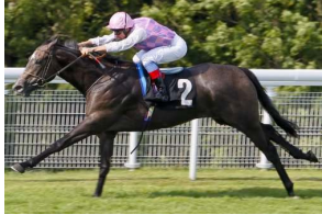
Amazing Maria

AMAZING MARIA (IRE) (f, 2, Mastercraftsman {Ire} -- Messias Da Silva, by Tale of the Cat ), who was seventh on debut over this trip at Newbury June 25 before filling the third spot when dropped to six back there last time July 19, was sent off the 7-2 joint favorite and raced behind the early pace. Taking control with three furlongs remaining, the