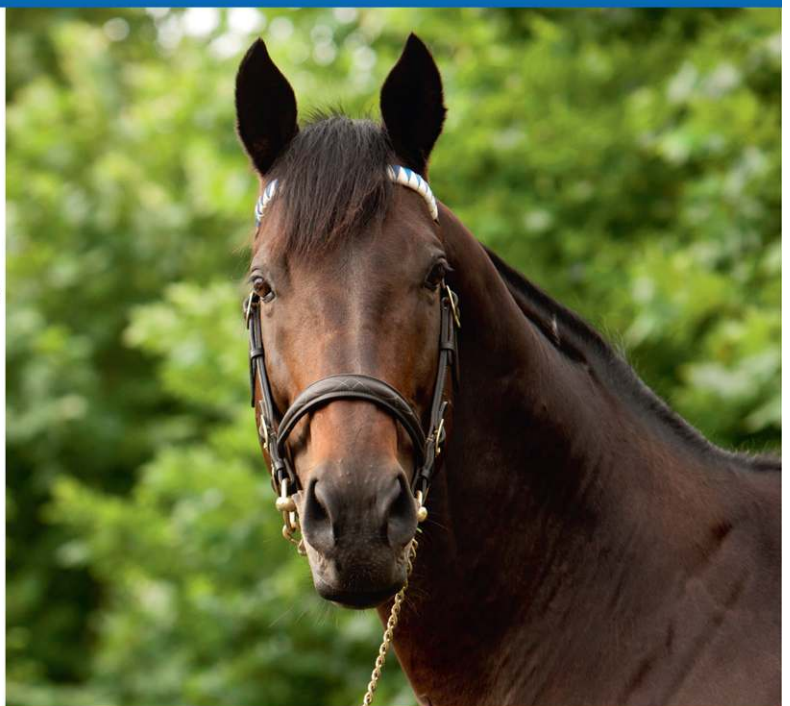
His yearling daughter out of Please Sign In made $1.45m in January. More yearlings sell at Saratoga next week.

Now siring stock for the big occasion: his six Stakes winners so far in 2013 feature G1 winner Aubby K and leading three-year-old filly, the G2 winner and Kentucky Oaks third Unlimited Budget , plus Graded scorers Cigar Street and Ice Cream Silence.