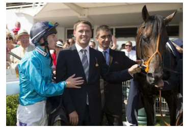
Owner Michael Owen with Brown Panther Racing Post