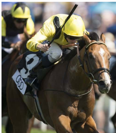
Saayerr

furlong pole and held off the unexposed Cable Bay in a gritty display as the pair pulled clear. "I'd say the extra furlong helped him, but five furlongs at Ascot is not a massive difference to six furlongs here," his rider said. "The race panned out quite well for him. They didn't go mad for the first two furlongs, but I got a nice tow for a good part of the race and, when the runner-up came on the outside, he found a bit more and just did enough."