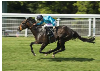
Brown Panther alone on the lead