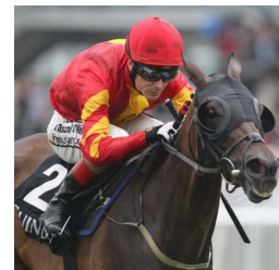
Yellow Rosebud