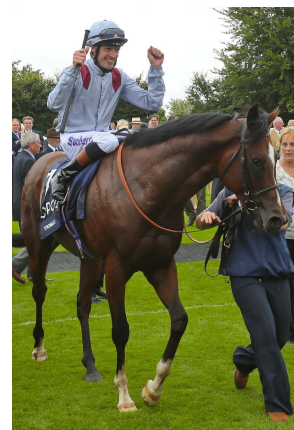
Toronado Racing Post