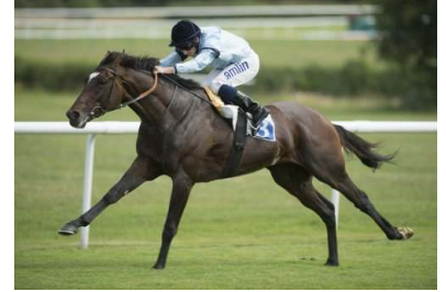
Telescope

For so long the subject of much excitement, Highclere Thoroughbred Racing's TDN Rising Star Telescope (Ire) (Galileo {Ire}) bid to turn the hype into substance when tackling his first pattern race in today's G3 Rose of Lancaster S. at Haydock. Denied a chance to take part in what looks a weak renewal of the Epsom Derby, the handsome colt has already flashed above-average ability when scoring by 24 lengths from a smart Godolphin colt named Mulakim (GB) (Pivotal {GB}), with another 20 back to a fair handicapper in Centurius (GB) (New Approach {Ire}) in a 10-furlong conditions race at Leicester on his belated sophomore bow July 18. Whatever the merit of that performance on paper, taking on hardened elders offers another examination and among his rivals is Khalid Abdullah's Noble Mission (GB) (Galileo {Ire}). Admittedly disappointing of late, the full-brother to Frankel (GB) has still mustered a win in last year's G3 Gordon S. at Goodwood and drops back in trip having looked to run out of steam when fourth in the G2 Hardwicke S. at Royal Ascot June 22. Field p9