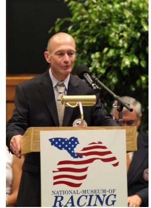
Calvin Borel