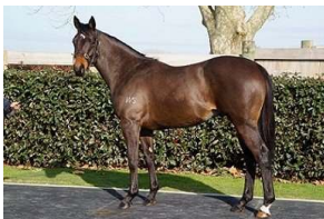
Lot 29