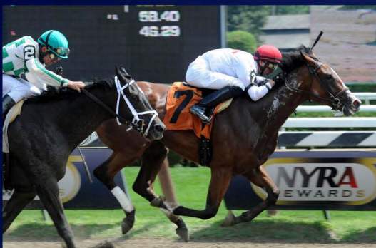
CON GEE , by CONGAREE , quickly overcame a stumble at the start and gave her all when asked, fending off her foes to win the $70,000, 5 1/2f MSW