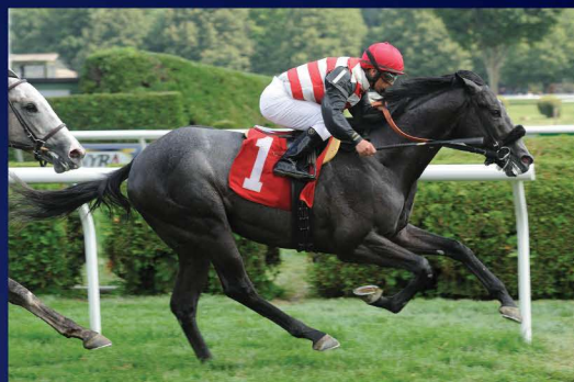
MARVIN'S MIRACLE , by COSMONAUT , took off when given his cue at the quarter pole, battling back gamely in the final furlong to win the $75,000, 1 1/16mT MSW to become his sire's first winner

Don't miss their NY Bred yearlings selling at Fasig-Tipton, August 10-11