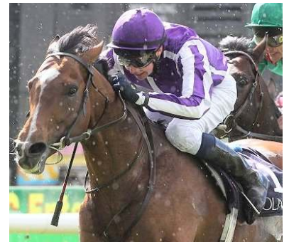
St Nicholas Abbey