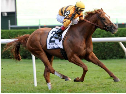
Wise Dan

Horse of the Year Wise Dan (Wiseman's Ferry) seeks to defend his title while spotting his rivals up to 14 pounds in today's GII Fourstardave H. at Saratoga. Last summer, the 6-year-old used this race as a springboard to the beginning of his current seven-race winning streak. Last term's GI Breeders' Cup Mile hero trimmed the hedges and overcame a couple of bobbles in the stretch over the yielding going en route to a two-length tally in the GII Firecracker H. at Churchill Downs most recently June 29. Wise