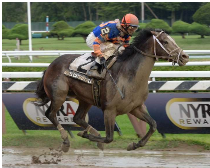
Hall of Famer John Velazquez guides Repole Stable's Notacatbutallama (Harlan's Holiday) to victory in Friday's GIII Hall of Fame S. at Saratoga (see page 5)