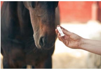
StableLab handheld blood analyzer

StableLab, a handheld blood analyzer, makes it possible to detect infection within minutes at the horse's side. It works by identifying and measuring Serum Amyloid A (SAA)--a protein produced by the liver to carry immune cells to the source of inflammation--in the horse's blood. Under normal, healthy conditions, SAA will be present at a level lower than 7.5 \mu\text{g/ml} , and will not be reflected on