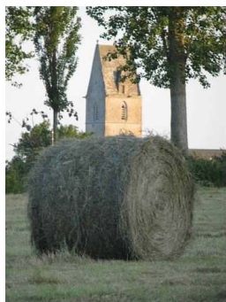
Typical countryside in the Calvados region