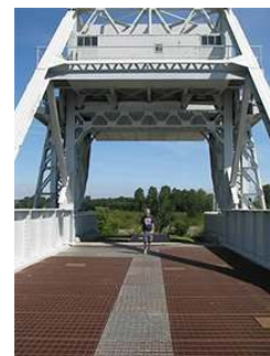
The original Pegasus Bridge is now part of the museum.