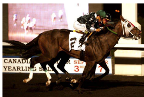
Go Greeley