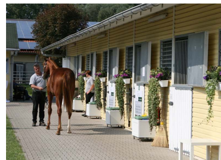
A yearling is inspected at the BBAG sales grounds

Following on from Deauville and Doncaster, Baden-Baden hosts the latest stopover on the Yearling Sales circuit when their Jahrlings-Auktion takes place today. Condensed from previous years, the forces behind the 242-strong catalogue will bid to build on the increasing profile of German