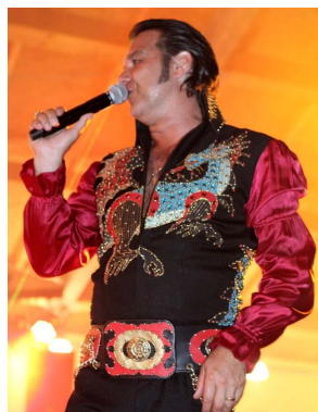
The German Elvis

Yes Elvis! Okay, a slightly portly Elvis and there is the small problem of him singing in German, but hey we