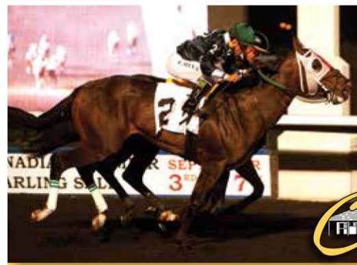
GO GREELEY wins his THIRD straight stakes at Woodbine.