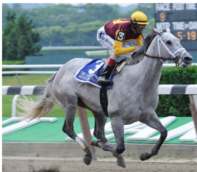
GISW Awesome Maria (Maria's Mon) will be part of the Robsham dispersal at KEENOV