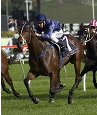
Atlantic Jewel

Group 1 racing for the 2013-14 season in Australia kicks off Saturday with the G1 Memsie S. at Caulfield, and it is an event certainly befitting of the highest level, with a number of the country's classiest performers resuming. Chief amongst them is Coolmore's Atlantic Jewel (Aus) (Fastnet Rock {Aus}), winner of the 2011 G1 1000 Guineas and 2012 G1 All Aged S. Injury has kept the 5-year-old off the racetrack since the latter effort, and she goes into this event without a trial, but her recent works have left connections confident that she will return to her best.