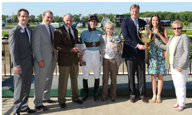
Belmont Winner’s Circle