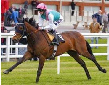
Joyeuse Racing Post