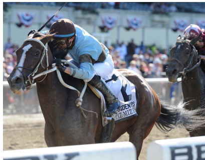
Tiz Miz Sue