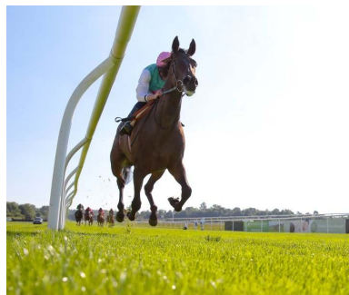
Radiator Racing Post

Radiator ran fifth to subsequent G3 Prestige S. victress Amazing Maria (Ire) (Mastercraftsman {Ire}) at Goodwood in her Aug. 1 debut, and Juddmonte's blueblood went postward as the 11-10 favorite for this return. Learning from her initial experience, she