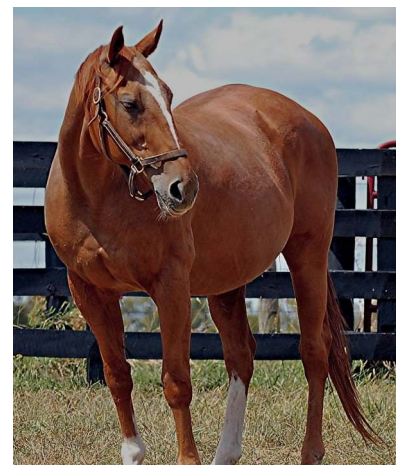
Klassy Briefcase (1985-2013)