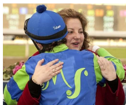
Samantha Siegel Benoit Photo

Knocked sideways after hitting the left side of the gate at the start, the dark bay sat in next-to-last in seventh through easy fractions of :23.42 and :46.99. Touchofstarquality finally entered the frame as he began to roll on the far turn, and exploded down the lane under a motionless Javier Castellano to inhale impressive next-out winner Silver and Onions (Tiz Wonderful)