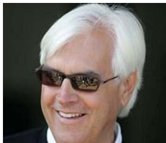
Bob Baffert

"We're getting close," Baffert offered without pinpointing an immediate target. "She wasn't moving right, so we turned her out. She's been training very well. We're expecting a big year from her."