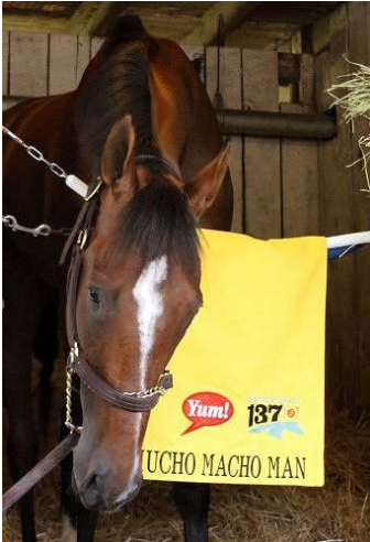
Mucho Macho Man

Jockey Gary Stevens will have the mount aboard 2012 GI Breeders' Cup Classic runner-up Mucho Macho Man (Macho Uno) when he goes postward in next Saturday's GI Awesome Again S., a 'Win and You're In' race for this year's Classic.