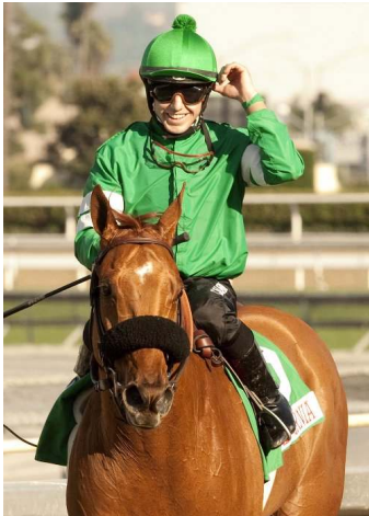
Caracortado