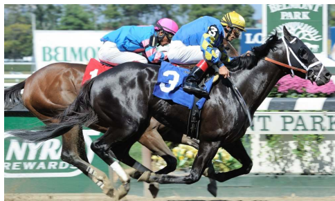
Shanghai Bobby on the wire

Juvenile Champion Shanghai Bobby returned nicely from a 5 1/2-month hiatus in yesterday's Aljamin S. The