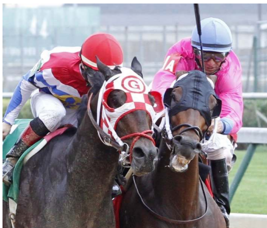
Homeboykris (inside) tries to bite eventual winner Froggyville near the finish of the second race at Churchill Friday