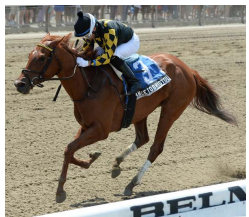
Dance to Bristol