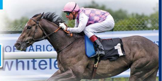
AMAZING MARIA Prestige Stakes-Gr.3