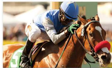
October Grad GOLDENCENTS G1 Santa Anita Derby