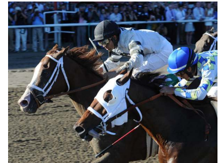
Will Take Charge (outside) noses out Moreno in Travers