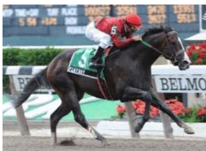
Flat Out