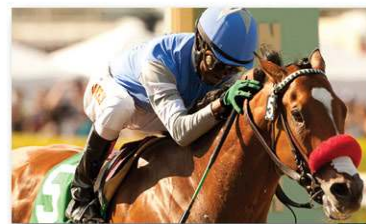
October Grad GOLDENCENTS G1 Santa Anita Derby