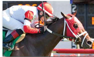
October Grad ADMIRAL KITTEN G1 Secretariat S