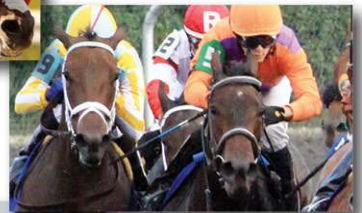
October Grad SPRING IN THE AIR G1 Darley Alcibiades S