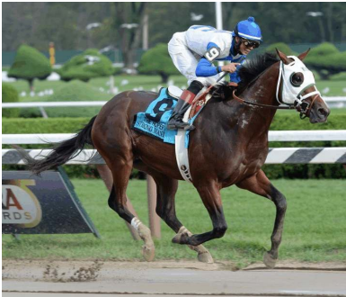
Strong Mandate

Also armed in the sophomore division, Lukas confirmed the GI Pennsylvania Derby winner Will Take Charge (Unbridled's Song) will continue preparations at Churchill Downs for his next intended start in the Nov. 2 GI Breeders' Cup Classic. The GI Travers S. hero is expected to ship to Santa Anita the week before his year-end objective. "He'll be tough on 'em," Lukas said. "He's getting better and he's got five or six weeks more to mature some more. He's put on about 25 pounds since the Travers, so he's filling out and really getting stronger."