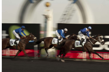
Soft Falling Rain winning the G2 Godolphin Mile

Sheikh Hamdan bin Rashid al Maktoum's Soft Falling Rain (SAf) (National Assembly) lost his unbeaten record when runner-up in the G2 Hungerford S. at Newbury Aug. 17, will look to start a new winning streak when he goes postward in today's G2 Joel S. at Newmarket.