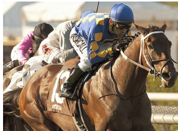
Unbridled's Note