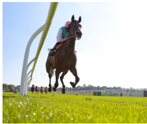
Radiator

★ "TDN Rising Star" ★ Radiator (GB) (Dubawi {Ire}), a Juddmonte Farms homebred daughter of the outstanding racemare Heat Haze (GB) (Green Desert), will try to build upon a smashing 15-length debut success when she makes her black-type debut in the G3 Oh So Sharp S. this afternoon at Newmarket.