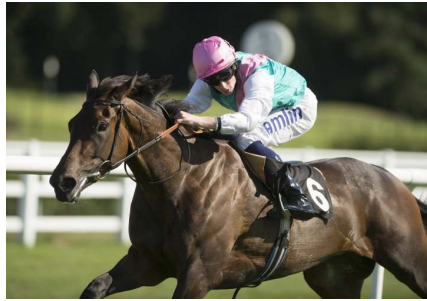
Radiator

So impressive when breaking her maiden by 15 lengths, ☆ "TDN Rising Star" ☆ Radiator (GB) (Dubawi {Ire}) bids to back up that visually stunning performance in today's G3 Oh So Sharp S. at Newmarket. A daughter of Juddmonte's accomplished