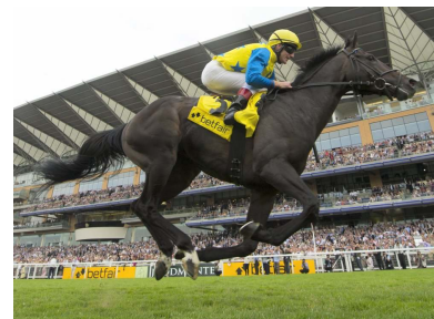
Novellist