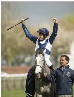
Goffs Orby graduate Sky Lantern Racing Post

Goffs' Orby Sale, which stages its latest renewal today and tomorrow in Co. Kildare, Ireland, has long been considered Ireland's best yearling sale. That point was driven home last year when the two-day feature posted dramatic gains across the board, including a 47% increase in average, a median jump of 38% and a gross of €27,189,500, up from €22,522,500 in 2011 despite 214 fewer horses being catalogued. Five horses surpassed €500,000 after none hit the mark in 2011, and the top price leapt from €350,000 to €800,000 when South Africa's Form Bloodstock held off Coolmore interests for a Galileo (Ire) half-brother to Grade I winner Lahaleeb (Ire) (Redback {GB}). The RNA rate dropped from 20% to 15%. It was a welcome boom for Goffs and the Irish breeders and