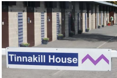
The Tinnakill consignment at Goffs