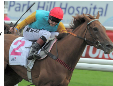
Wild Coco