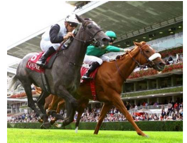
Ebiyza (outside)