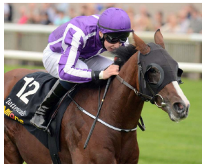
Oklahoma City Racing Post

form," commented Aidan O'Brien. "He's a hardy horse."