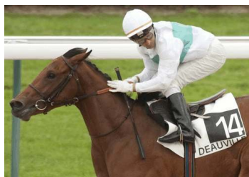
Moonlight Cloud (GB)