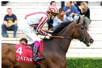
Cirrus des Aigles

Twelve months ago, when Cirrus des Aigles romped to a nine-length success in this contest, he had already won in 2010 prior to making Frankel (GB) (Galileo {Ire})