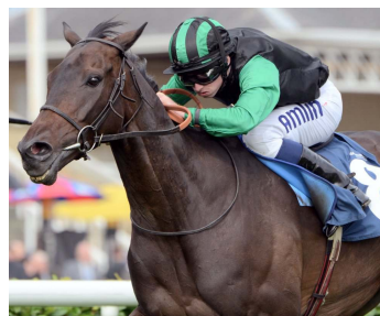
Times Up

Today's G1 Qatar Prix du Cadran at Longchamp appears a tight contest which will inevitably favor a strong stayer with a touch of class and that applies to the British challenger Times Up (GB) (Olden Times {GB}). Nurtured by John Dunlop to the heights of