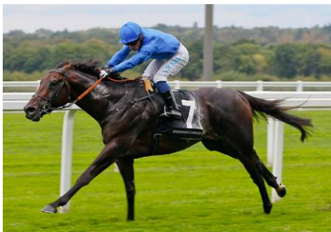
Secret Number

Aug. 21, and sixth in the G1 St Leger at Doncaster last time Sept. 15. Settled in third early, the homebred was nudged along to take over passing the quarter pole before asserting for a comfortable success from stable companion Royal Empire. "He's still a little bit weak, but will be better with age," trainer Saeed bin Suroor commented. "After he won in Dubai and was third in the UAE Derby he seemed to improve with every race and this trip is the best for him. It is so far so good with him and Royal Empire will go to the G1 Melbourne Cup now. He starts quarantine tonight. The ground here didn't suit him, as he needs it fast and he's doing really well now. Kerrin McEvoy will ride him."