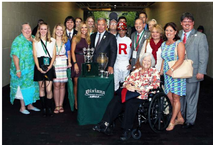
The connections of We Miss Artie