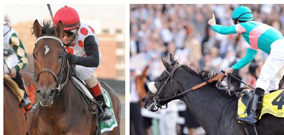
#750 Zenyatta 2004

A # will distinguish first-time stakes-winners, a @ will indicate first-time graded stakes-winners, a ▲ will denote a first-time Grade/Group 1 winner, a + will indicate first-time starters, an (S) will be used for state-bred races, a (C) will be used for maiden-claiming races and an (R) will be used for other restricted races.