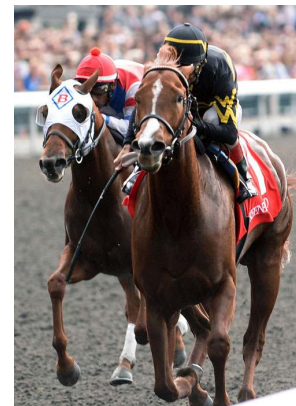
Judy the Beauty (inside)