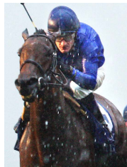
Better Lucky

Wise Dan wasn't the only Eclipse champion upended at Keeneland yesterday. Groupie Doll (Bowman's Band) could do no better than third in the GII Thoroughbred Club of America S., won by Ghostzapper's Judy the Beauty. That Adena sire added a Grade I win to his account later in the afternoon when Godolphin's Better Lucky stormed down the boggy turf course to take the First Lady, and WinStar's Artie Schiller capped a momentous weekend at the Lexington oval when We Miss Artie became his second Grade I winner there in two days in the Breeders' Futurity.