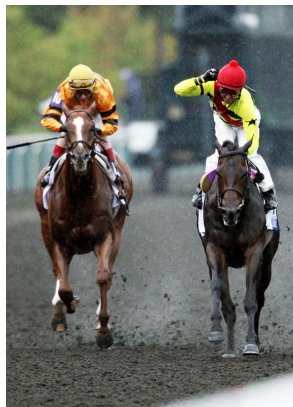
Silver Max (red cap) holds off Wise Dan

Rider John Velazquez, who piloted the beaten favorite, said, "He ran a good race; he just didn't run his 'A' game today... At the three-eighths pole, I thought I was going to be in control, that [running down Silver Max] was going to be easy, but when I went after him, he (Silver Max) started running again."