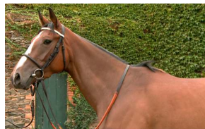
Kenhope