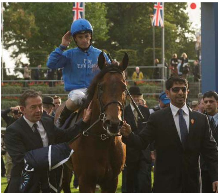
Farhh is led into the winner's enclosure