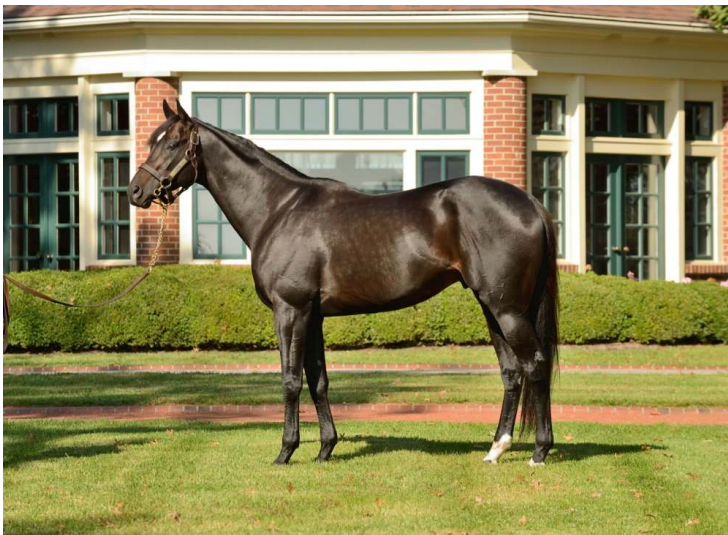
Morning Line at Lane's End