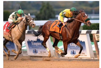
Saratoga Snacks

Saratoga Snacks, a valiant second behind Lunar Victory (Speightstown) in this race last year, closed out his sophomore campaign with a win in Aqueduct's Alex M. Robb S. Dec. 26. He earned a career high 105 Beyer Speed Figure when capturing Belmont's seven-furlong Shy Groom S. in his seasonal debut June 30, and was most recently a troubled third behind the ill-fated Saginaw