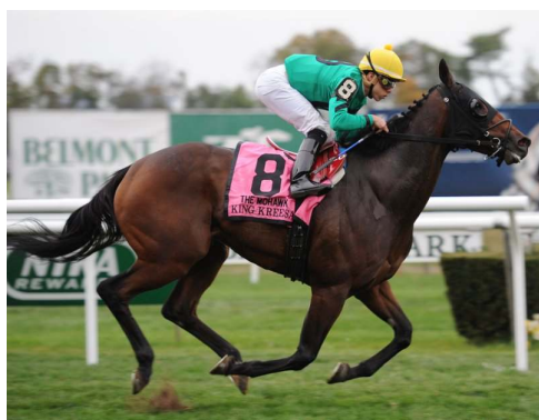
King Kreesa

King Kreesa, a game second in last term's GI Jamaica H. at Belmont Park, registered a career high in the GIII Poker S. July 4. He gave Horse of the Year Wise