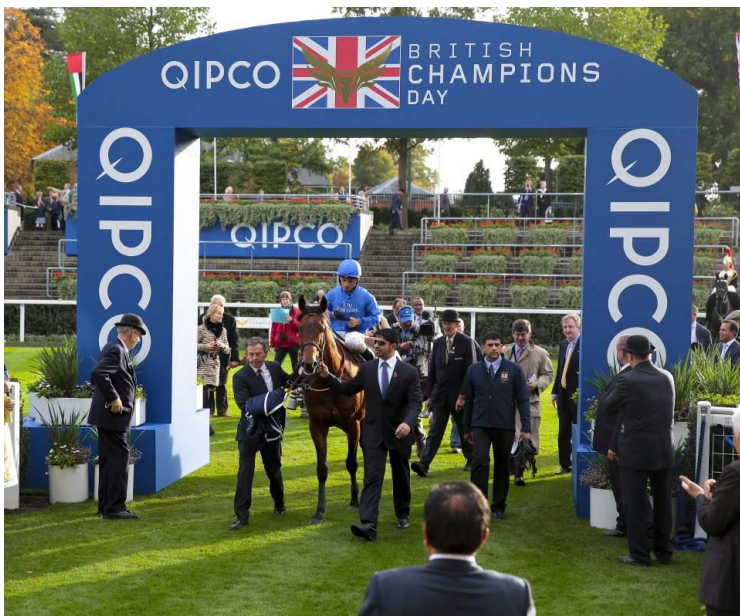
Farhh being led in

Click for the Racing Post result , the brisnet.com PPs or the free brisnet.com catalogue-style pedigree . VIDEO , courtesy attheraces.com .