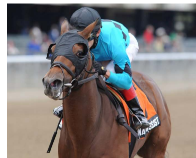
Miss Narcissist