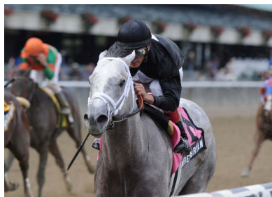
Wired Bryan