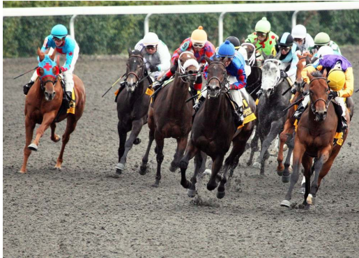
Madame Cactus eight wide on the turn for home