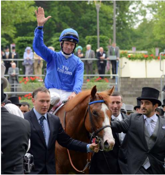
Dawn Approach Racing Post