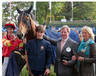
The winning connections with Seal of Approval

Seal of Approval went from a 12-furlong Kempton handicap win July 3 to Newbury's Listed Chalice S. also over that trip Aug. 4 and duly added that contest to her tally with something in hand. Still in with a shot when clipping heels and coming down in the G2 Park Hill S. over the St Leger trip at Doncaster last time Sept. 12, the otherwise upwardly mobile bay put that incident firmly behind her with an authoritative display to cause an upset here. Positioned in fifth early, the bay was