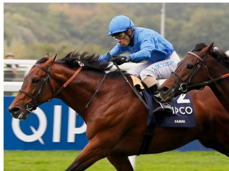
Farhh turns back Cirrus des Aigles Racing Post

Despite returning from a five-month break after suffering another of his recurrent setbacks following Newbury's G1 Lockinge S. in May, Godolphin's Farhh (GB) (Pivotal {GB}) had enough in reserve to get the better of Cirrus des Aigles (Fr) (Even Top {Ire}) and