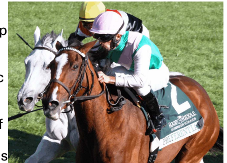
Preferential

Preferential, a stakes winner in France last summer for trainer Christiane Head-Maarek, had been winless in four previous U.S. outings, most recently finishing a neck runner-up in the Sept. 7 Kentucky Downs Ladies Marathon S. The bay filly settled into a stalking position while saving ground early. In tight quarters as the field bunched up after three-quarters in 1:16.55, Preferential weaved through traffic before squeezing between rivals in deep stretch and holding off Left a Message in the final strides. “I think it’s