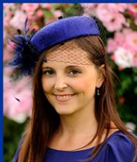
- Gina Bryce, Channel 4 Presenter

"Although as a former TDN intern I am slightly biased, the daily newsletter is a must read to stay up to date with the global Thoroughbred industry. For someone interested in bloodstock, I find the focus on pattern race results with details of the winners' breeding really useful to keep a gauge of which stallions are siring good quality winners. The detailed sales reports are brilliant to skim through and again stay abreast of the health of the bloodstock markets in different countries. Not only is the publication a great source of information, but it is also light-hearted and full of personality. I love reading about the different characters on the sales grounds, the stories behind the big winners or sale toppers and more importantly wherever you find yourself in the world, the TDN makes sure you don't miss out on the best local haunts!"