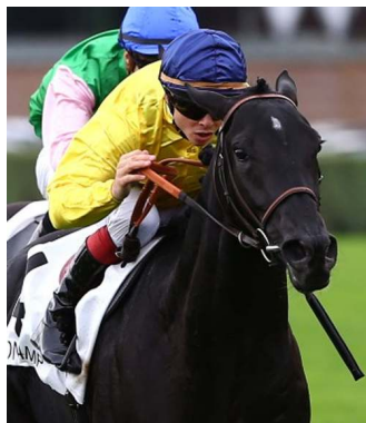
Elliptique Scoop Dyga

attempt beyond eight panels, he inched closer along the false straight and kept on resolutely under a final-quarter drive to assert for a career high. "He's a nice colt who has not run a bad race and has been improving," trainer Andre Fabre commented. "He's now run four times, so we will put him away until next season when he will make a nice 3-year-old."