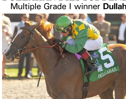
Dullahan

Multiple Grade I winner Dullahan (Even the Score--Mining My Own, by Smart Strike) died early Sunday morning at Rood and Riddle Equine Hospital in Lexington due to complications from colic. Dullahan's career was highlighted by a victory in the GI Dixiana Breeder's Futurity as a juvenile. The Donegal Racing