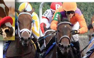
October Grad SPRING IN THE AIR G1 Darley Alcibiades S