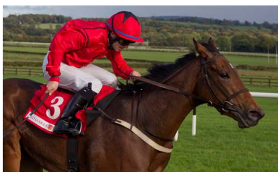
Wannabe Better

Wannabe Better followed a ready win in the Aug. 28 Listed Ruby S. at Killarney with a last-of-12 finish when pitched into the Sept. 7 G1 Matron S. at Leopardstown,