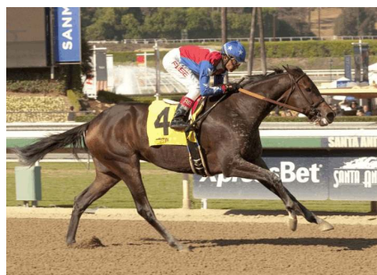
Taste Like Candy

Taste Like Candy, who prepped for this unveiling with a best-of-four six-furlong drill in 1:13 1/5 Oct. 15, was sent off at 9-2. Fourth behind a pair of dueling leaders through an opening quarter in :22.08, the bay filly inched into contention early on the bend and surged to the lead with a four-wide move into the lane through a half in :45.66. She sailed clear under a hand ride to win by 6 1/2