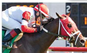
October Grad ADMIRAL KITTEN G1 Secretariat S