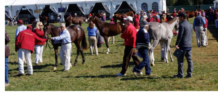
Shoppers at Taylor Made on Sunday

That bodes well for an October Sale that has seen its stock rise in recent years. Graduates have included the 2008 GI Kentucky Derby winner Big Brown (Boundary), a $60,000 purchase; and the 2009 Derby hero Mine That Bird (Birdstone), a $9,500 acquisition.