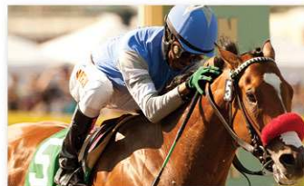
October Grad GOLDENCENTS G1 Santa Anita Derby