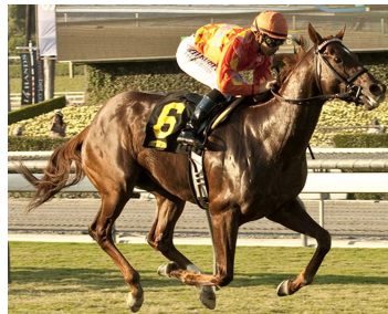
Tom's Tribute

Margins: 2 1/4, HF, 3/4. Odds: 1.00, 4.50, 4.60.