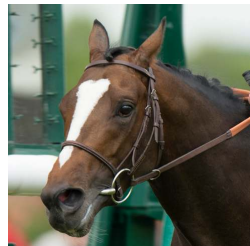
Intello Racing Post

Wertheimer Et Frere's Intello (Ger) (Galileo {Ire}--Impressionante {GB}, by Danehill), winner of this year's G1 Prix du Jockey Club, has been retired and will enter stud next year at Cheveley Park Stud in Newmarket, England. Intello is also set to stand the 2015 season at Cheveley Park before moving to the Head family's Haras du Quesnay for the following two years. He will stand for £25,000.