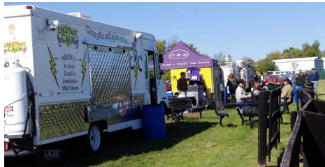
Food trucks L. Marquardt

For complete catalog and outs, or to watch the October Sale live, visit www.fasigtipton.com .