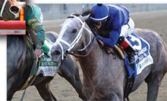
October Grad HAVANA G1 Foxwoods Champagne S