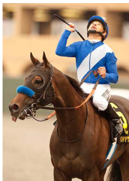
Points Offthebench