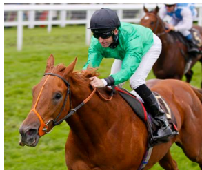
Piping Rock Racing Post

Piping Rock went from a debut success over six furlongs at Ascot July 28 to a conditions event over this trip at Salisbury Oct. 2, where he shook off any rustiness after a break to inflict a four-length defeat on