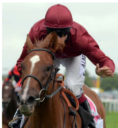
The Lark Racing Post