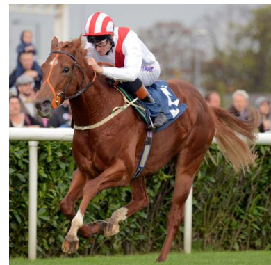
Night of Thunder