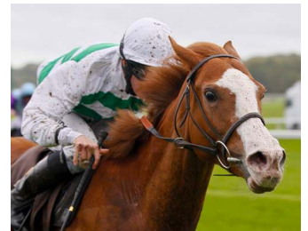
Cubanita Racing Post