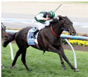
Shamus Award