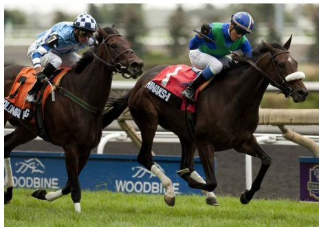
Minakshi & Colonial Flag