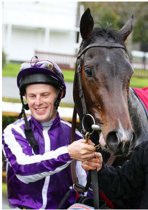
Craftsman &

With a record nine wins already in this important juvenile staging post, it was perhaps surprising that Aidan O'Brien did not supply the favorite, but he duly turned that logic on its head by extending his dominance when saddling a one-two with Craftsman leading home his better-fancied stable companion Michaelmas. Runner-up on debut over this trip at Gowran Park Sept. 4, the bay was off the mark on a testing surface at Listowel Sept. 18 before finishing third in Naas'