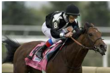
Joshua Tree