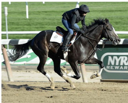
Honor Code Adam Coglianese

Lane's End and Dell Ridge Farms' "TDN Rising Star" Honor Code (A.P. Indy) breezed an easy five furlongs in 1:03.34 over Belmont Park's main track Sunday morning in preparation for the GII Remsen S. Nov. 30. The son of Serena's Cat (Storm Cat) most recently finished second in the GI Foxwoods Champagne S. Oct. 5 following an impressive debut score at Saratoga Aug. 31.