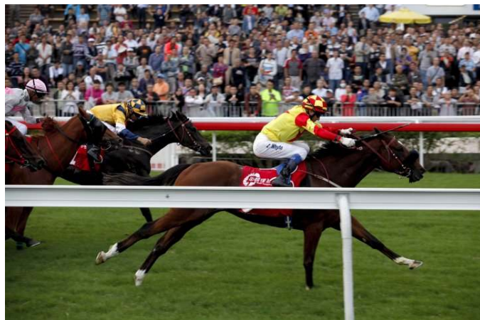
Charles 'in charge'

The 4-year-old was a progressive sort last racing season, with a victory in Class 1 and a runner-up effort one peg lower ahead of a breakthrough success over Best Eleven (Aus) (Charge Forward {Aus}) in the Sha Tin Vase H. May 26. A troubled 11th to stablemate Sterling City in the Premier Cup H. June 16, he belied longshot odds to finish third in the Sha Tin Sprint Trophy H. up the 1000-meter straight Oct. 1 and was exiting a third to Sterling City in the course-and-distance Premier Bowl H. Oct. 27.