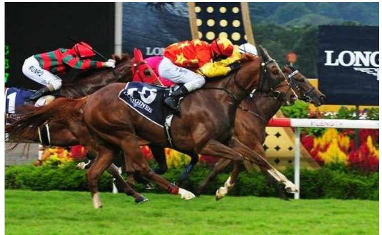
Tropaios (near) Singapore Turf Club