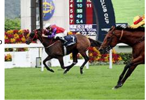
Endowing (Ire)

With reigning Hong Kong horse of the year and dual International Group 1 winner Military Attack (Ire) (Oratorio {Ire}) and two-time defending G1 Hong Kong Cup hero California Memory (Highest Honor {Fr}) perhaps one run away from their absolute peak, the less-heralded third race favorite Endowing (Ire) (Danehill Dancer {Ire}) parlayed a perfect inside trip into a victory in Sunday's G2 Jockey Club Cup at Sha Tin.