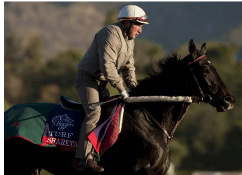
G1SW Shareta (Ire)

Goffs' November Sale commences today at Kill Paddocks in Kildare, Ireland. The seven-day stand begins with the four-day Foal Sale, which features 928 lots including the progeny of such leading sires as