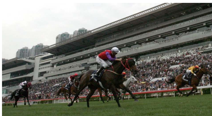
Endowing (left) gets home just ahead of Akeed Mofeed