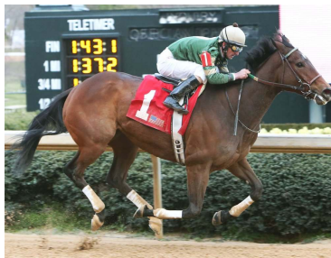
Don't Tell Sophia Coady Photography

In other holiday stakes action, Caixa Eletronica (Arromanches) seeks his second straight win in the GIII Fall Highweight H. as he faces seven rivals in Aqueduct's Thanksgiving day feature.