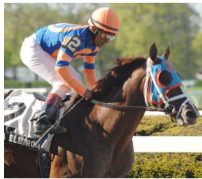
Caixa Eletronica

Plus fields were drawn yesterday for the GIII Vernon O. Underwood S., GII Go For Wand H., GII Citation H., and GIII Berkeley H.