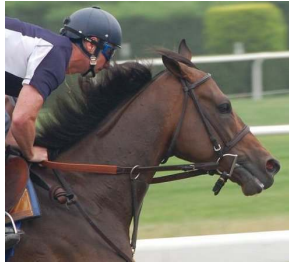
Game on Dude Sherackatthetrack

Game on Dude (Awesome Again), looking to rebound from a disappointing effort in the GI Breeders' Cup Classic, tuned up at Hollywood Park Sunday ahead of a trip to Kentucky for Friday's GI Clark H.