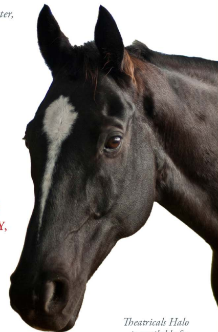
Theatricals Halo is available for adoption at LoneStar Outreach to Place Ex-racers, a TCA grantee

Please visit tca.org to purchase tickets.