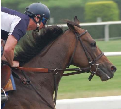
Game on Dude Sherackatthetrack