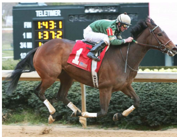
Don't Tell Sophia