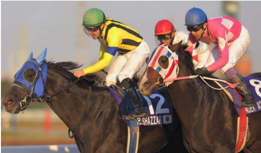
Belshazzar (Jpn) (King Kamehameha {Jpn}) takes Hanshin's G1 Japan Cup Dirt. Coverage begins p5