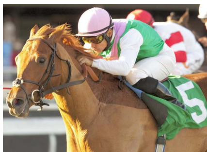
Seek Again

The English-raced Seek Again (Speightstown) ran up the rail to his first black-type success in the