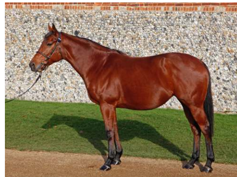
Immortal Verse Tattersalls

December Breeding Stock Sale. Featured on day one is Dancing Rain (Ire) (Danehill Dancer {Ire}), the 2011 G1 Epsom Oaks and G1 Preis der Diana winner, carrying a member of the first crop of Frankel (GB).