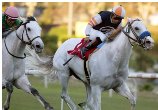
Egg Drop (left) and Discreet Marq in the stretch

Egg Drop (Alphabet Soup) showed an enormous amount of heart, re-rallying gamely for a narrow victory in the 31st and final running of the GI Matriarch at Betfair Hollywood Park yesterday. The Little Red