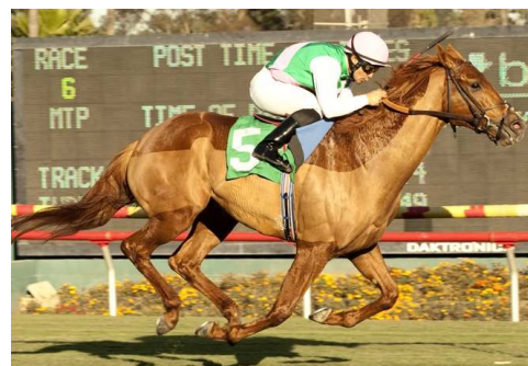
Seek Again

Seek Again began his career with a win at Newmarket last September and finished second in a Leicester allowance that October. The Juddmonte homebred was given a 10-month break, before returning to win a Newmarket handicap Aug. 15 before finishing second in a handicap over the Kempton synthetic Aug. 23.