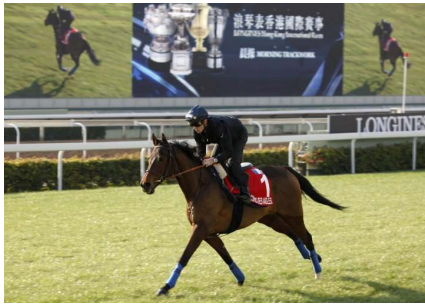
Cirrus des Aigles HKJC.com

If it's December and it's Hong Kong, it must be Cirrus des Aigles (Fr) (Even Top {Ire}). The blue-collar French raider has made the trek in each of the last five seasons, posting a deceptively good fifth-place effort at 15-2 behind his compatriot Daryakana (Fr) (Selkirk) in the 2009 Vase followed by a midfield seventh to Snow