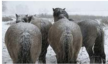
Thursday Cancellations Remington Park