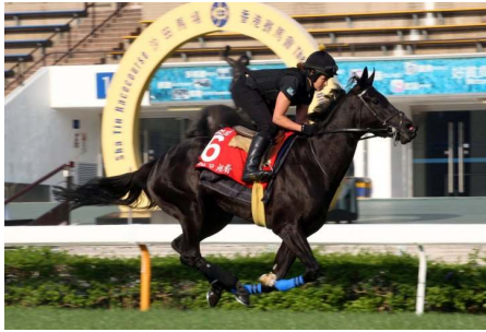
Side Glance