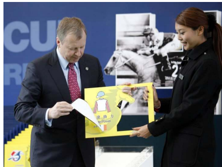
Winfried Englebrecht-Bresges, CEO of the Hong Kong Jockey Club, starts the draw for the Sprint

The connections of Lord Kanaloa (Jpn) (King Kamehameha {Jpn}), who is looking to go back-to-back in the G1 Hong Kong Sprint, weren't unduly concerned when they drew post position 12 in a field of 14 Sunday. "There was no specific number which we