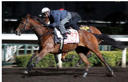
Frederick Engels