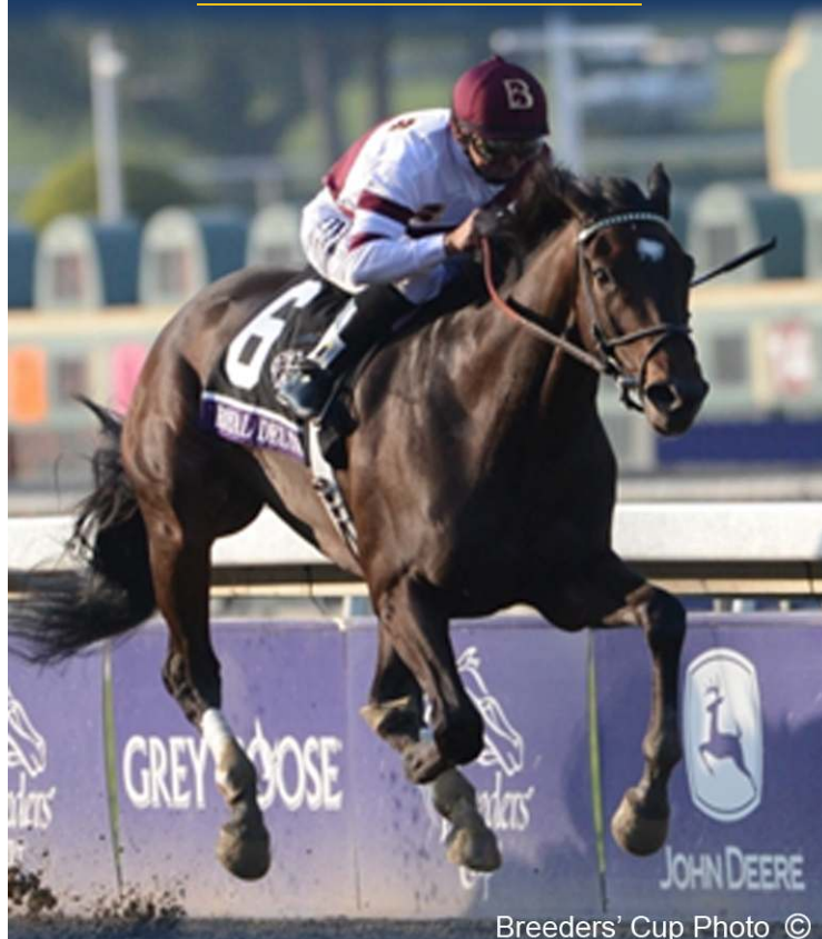
Breeders' Cup Photo ©

"Transparent information and statistical data is standard for the modern-day investor and OwnerView provides that platform for any existing or prospective owner."