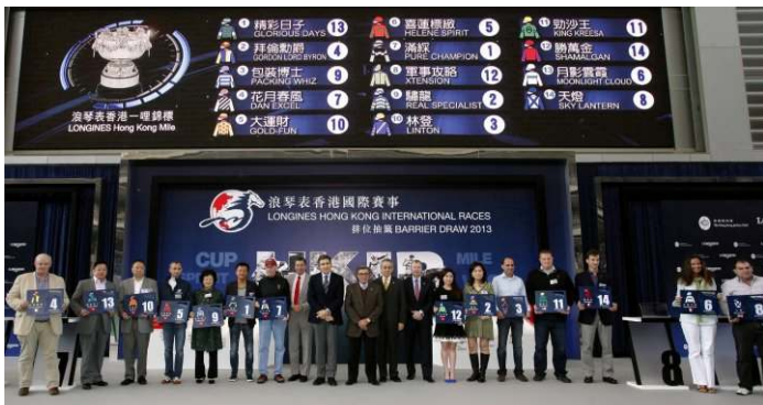
The Mile field