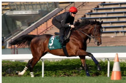
Mount Athos

If anything, the 2400 meters of the G1 Hong Kong Vase could prove a little too short for Mount Athos (Ire) (Montjeu {Ire}). A nine-length winner of the G3 Ormonde S. going an extended 13 furlongs this past May, he was fifth in the G2 Hardwicke S. at this trip