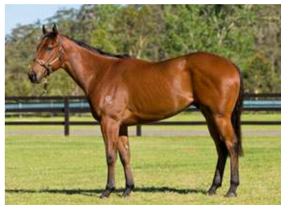
Lot 19 HKJC.com

The last of the 16 horses scheduled to go through the ring Saturday could prove most popular. Lot 19, a 3-year-old gelding by the outstanding champion sire