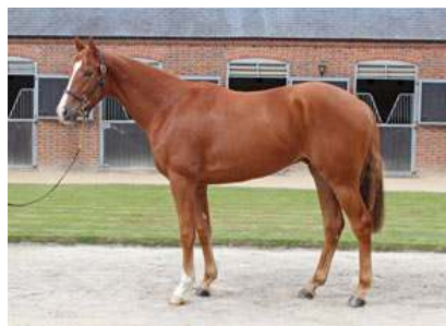
Lot 9 HKJC.com

Of those horses acquired at European auction houses, lot 9 was the dearest purchase on a final bid of 220,000gns. A son of top International sire Exceed and