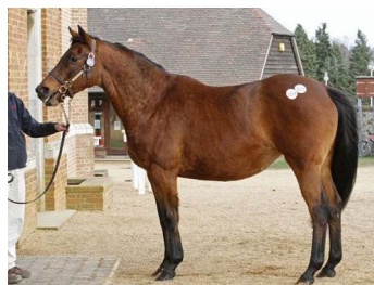
Capistrano Day Tattersalls

Former smart performer Capistrano Day (Diesis) led the way during the final session of the fortnight, selling for 60,000gns to Peter Kelly of Emerald Bloodstock. A listed winner and Group 3-placed in her racing days, the 17-year-old mare ( lot 2275 ) is the dam of five winners,