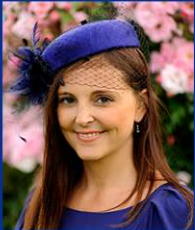
- Gina Bryce, Channel 4 Presenter

“ Although as a former TDN intern I am slightly biased, the daily newsletter is a must read to stay up to date with the global Thoroughbred industry. For someone interested in bloodstock, I find the focus on pattern race results with details of the winners' breeding really useful to keep a gauge of which stallions are siring good quality winners. The detailed sales reports are brilliant to skim through and again stay abreast of the health of the bloodstock markets in different countries. Not only is the publication a great source of information, but it is also light-hearted and full of personality. I love reading about the different characters on the sales grounds, the stories behind the big winners or sale toppers and more importantly wherever you find yourself in the world, the TDN makes sure you don't miss out on the best local haunts! ”