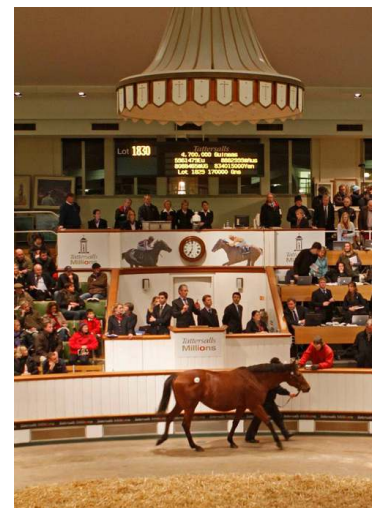
Sales-topping Immortal Verse Tattersalls