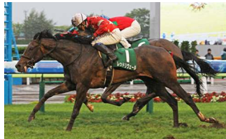
Red Reveur Japan Racing Association

Red Reveur was a debut winner over this track and trip on debut June 1, and she showed her class by jumping up to group company and besting males in the G3 Sapporo Nisai S. going 1800m at Hakodate Aug. 31. She finished just a neck the better of Meine Greville (Jpn) (Brian's Time) on that occasion, but that pair finished seven lengths the better of the rest of the field. Settling midpack between runners through the early