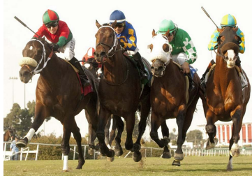
Boat Trip (outside) on the wire