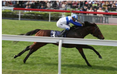
Lord Kanaloa HKJC.com