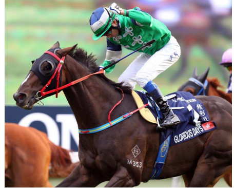
Glorious Days