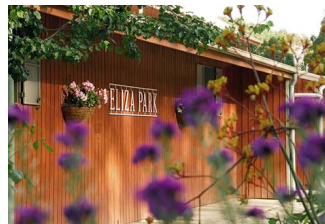
Eliza Park elizapark.com.au

Eliza Park, one of Australia's most recognized brands on the commercial scene since it was established in 1998, in June announced the sale of its operation to the Hong Kong-based Sun International Group, an