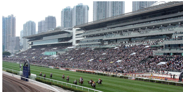
A crowd of 70,000 takes in the International Races