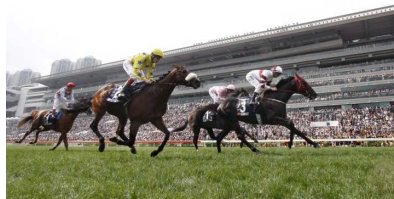
Dominant (3) HKJC.com