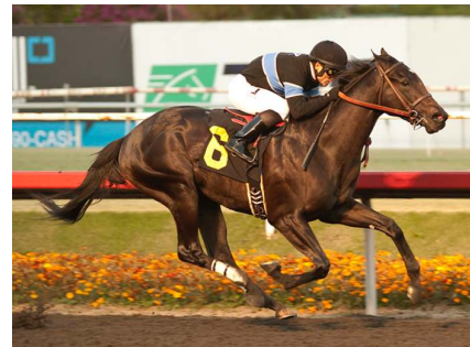
Shared Belief