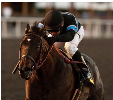
Shared Belief