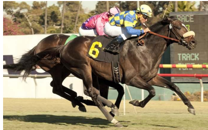
Lucayan (Fr)

● Heart Stealer (Speightstown) snags Gulfstream's GIII Sugar Swirl H.