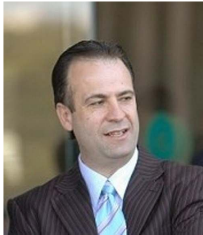
Peter V'landys

Racing New South Wales, the governing body for racing in that Australian state, has revealed that it is working on the development of an equine biological passport that would monitor physiological changes in a horse throughout its racing career, according to.