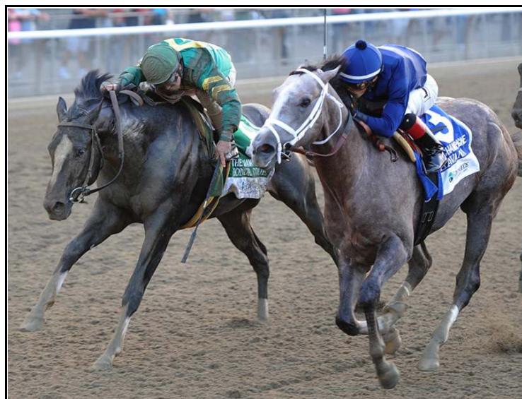
Did You Know?... 2013 GI Champagne S. one-two finishers Havana (Dunkirk) and Honor Code (A.P. Indy) were both named "TDN Rising Stars"

Visit the TDN Rising Stars section on our website!