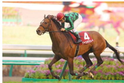
Just a Way

Just a Way (Jpn) (Heart's Cry {Jpn}), who has led the way in the Longines World's Best Racehorse Rankings since his Mar. 29 G1 Dubai Duty Free victory through the most recent publication of those standings Nov. 9, will enter stud this year at Shadai Stallion Station in Hokkaido, Japan, according to Racing Post . The 6-year-old will stand alongside his sire for a fee of ¥3.5 million (US$29,758).