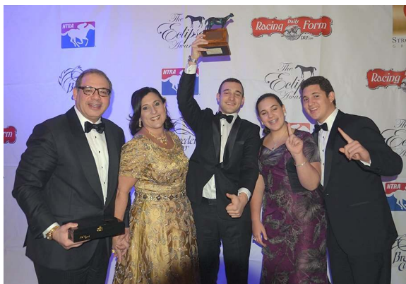
The Zayat family