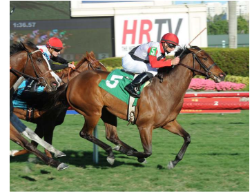
Bugle A Coglianese

BUGLE (f, 3, War Front --Chatham {MSP, $156,431}, by Maria's Mon), a close second as the favorite on debut over a grassy mile at Churchill Downs Nov. 9, missed by only a nose once again as the 6-5 crowd's pick over 1 1/16 miles of Gulfstream lawn Dec. 11. She took all the money at the windows and was 2-1 in this third go. The $400,000 Keeneland September yearling raced in midpack against the pine. With work to do with three furlongs yet to travel, Bugle shifted to the outside of a tiring rival before splitting horses in late stretch to win by 3/4 lengths over Daring Duchess (Arch). Under Bugle's third dam is champion juvenile filly and MGISW Flanders (Seeking the Gold), who produced champion 3-year-old filly & MGISW Surfside (Seattle Slew). Sales history: $400,000 yrl '13 KEESEP. Lifetime Record: 3-1-2-0, $39,400. Click for brisnet.com chart or VIDEO . O-Joseph Sutton. B-Stone Farm (KY). T-E Kenneally.