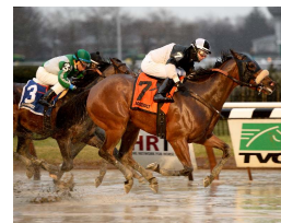
Captain Serious

Captain Serious established himself as a New York-bred on the rise by taking his first three starts against restricted company, capped by a score in the Mike Lee S. at Belmont in late May. Second in the Gill Dwyer S. there and third in Saratoga's GII Amsterdam S., the gelding returned to state-bred company to be fourth in the Albany S. at the Spa Aug. 24. The bay was third behind Bakken (Distorted Humor) in a 6 1/2-furlong optional claimer at Belmont Oct. 2 before checking in fourth after a wide trip in the state-bred restricted Hudson H. over that same trip and surface Oct. 18.