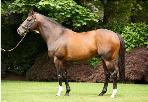
Holy Roman Emperor coolmore.com

The sire's offspring became increasingly popular and were offered with greater frequency at the Hong Kong International Sale. In 2001, a son of Mer du Sud (Ire) (Bluebird) fetched HK$1.6 million (US$205,128). The Australian-bred gelding came to be known as The Duke (Aus) and hit the board in