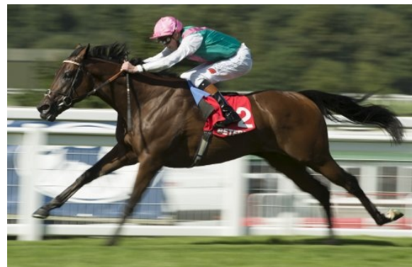
KINGMAN (GB) – Rating 127 O-Khalid Abdullah; B-Juddmonte Farms Ltd; T-John Gosden (c, 2011, Invincible Spirit {Ire}–Zenda {GB}, by Zamindar) Click for the free brisnet.com catalogue-style pedigree Major Victories G1 St James's Palace S. • G1 QIPCO Sussex S. • G1 Prix Jacques le Marois