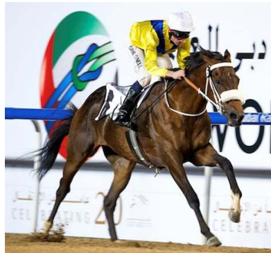
Mubtaahij