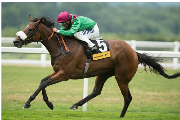
Euro Charline Racing Post