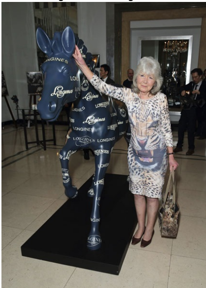
Author Jilly Cooper