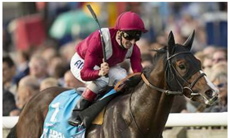
Belardo

"Found looked brilliant when winning the Marcel Boussac. She was stopped in her run, but still quickened up again to pull clear in the finish. She is beautifully bred, being the daughter of Red Evie, whose nine wins included the G1 Lockinge S. The sky is the limit for her and she is a worthy favourite for the 1000 Guineas."