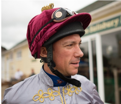
Frankie Dettori

Frankie Dettori will be at Gulfstream Park Feb. 7 to ride at least two horses in graded stakes events on the GI Donn H. day card, including Sandiva (Ire) (Footstepsinthesand {GB}) for Al Shaqab Racing in the GIII Suwanee River H. Javier Castellano rode the 4-year-old filly last out in her winning effort in the Dec.