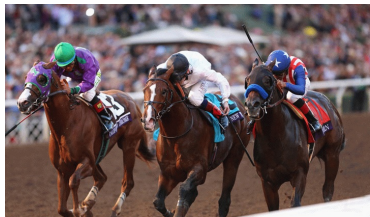
California Chrome, Toast of New York and Bayern could rendezvous again in the desert

A total of 2,142 nominations have been received from no fewer than 19 nations for the nine races that comprise the Dubai World Cup program, to be held this year Mar. 28 at Meydan Racecourse. Of the 20 highest-rated Thoroughbreds that remain in training in 2015, 13 of those have been nominated to at least one of the seven-figure tests--four each on the turf and the newly installed dirt surface.