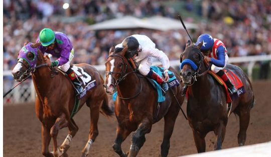
California Chrome, Toast of New York and Bayern could rendezvous again in the desert

The 10-furlong test has been mooted as a possible destination for the top seven horses home in last year's GI Breeders' Cup Classic, including the victorious Bayern (Offlee Wild), Toast of New York (Thewayyouare)--winner of the G2 UAE Derby on the DWC undercard in 2014--and recently anointed U.S.