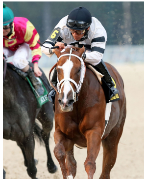
Take Charge Brandi