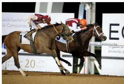
One Man Band

3rd-MEY, $60,000, Hcp, NH4yo/up & SH3yo/up, 1600m, 1:39.22, ft. ONE MAN BAND (IRE) (c, 4, Pivotal {GB} --Musicanna {GB} {SW & MG1SP-Eng, $191,671}, by Cape Cross {Ire}) broke his maiden at fourth asking--and second time in Dubai--over 9 1/2 furlongs at Meydan Dec. 4, and was third behind Filfil (Hard Spun) when dropped back to this trip Dec. 31. One Man Band