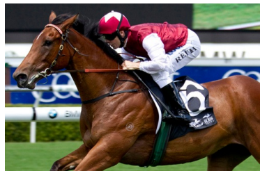
Earthquake Racing and Sports

Connections of last year's G1 Blue Diamond S. heroine Earthquake (Aus) (Exceed And Excel {Aus}), said they were happy with the filly's :45:82 zip in a 800-meter trial at Cranbourne Thursday. The 3-year-old filly was appearing in public for the first time since