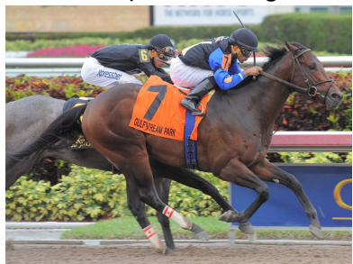
Barbados