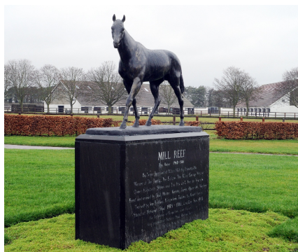
Mill Reef statue at the National Stud