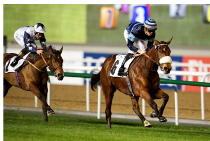
Cladocera

The lightly raced Cladocera made it two Cape Verdi's for the trainer/jockey combination of Alain de Royer Dupre and Christophe Soumillon while earning her first group victory here. After breaking her maiden at first asking at Chantilly last April, Cladocera flashed her talent when garnering the Listed Prix des Lilas at Longchamp by two lengths June 3. She checked in last of 10, however, when stepped up to group level for the