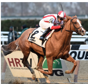
Leave the Light On