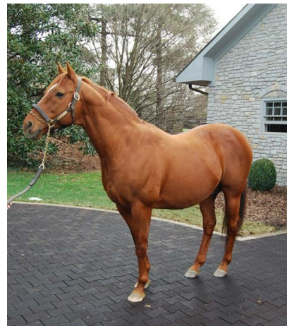
Thunder Gulch