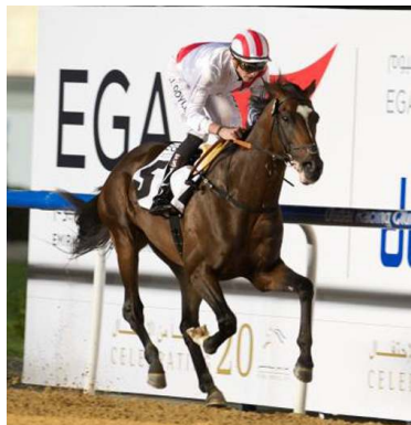
I'm Back DRC/Andrew Watkins

1st-MEY, $110,000, Hcp, NH4yo/up & SH3yo/up, 1900m, 1:59.87, ft. I'M BACK (IRE) (h, 5, Exceed and Excel {Aus} --Paracel, by Gone West) became the first horse to win two races at this year's carnival when taking out the opener. A distant 12th in a six-furlong turf handicap in his lone