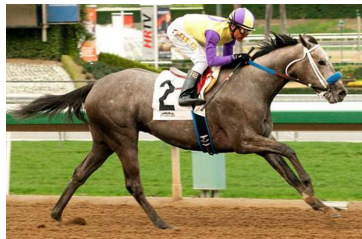
Rattataptap Benoit Photo

RATTATAPTAP (f, 3, Tapit--Sindy With an S {GSW, $330,959}, by Broken Vow) bested Popover (Lookin at Lucky), who went on to become a TDN Rising Star ⚡, in her 6 1/2-panel debut over the Del Mar synthetic Nov. 29. Immediately stepped up to black-