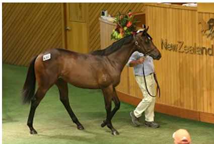
Yesterday's session topper, lot 657 NZB

The highest-priced yearling on day two (lot 657 ), at NZ$210,000, represented the cross of two champion sires in New Zealand, being by O'Reilly (NZ), out of the winning mare Saheel (NZ) (Zabeel {NZ}). Legendary sire Zabeel, whose very last yearling to go through a sales ring fetched NZ$160,000 at this week's Premier Sale, is a prolific broodmare sire with his daughters having produced 23 Group 1 winners to date.