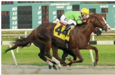
Catalina Red Tampa Bay Downs