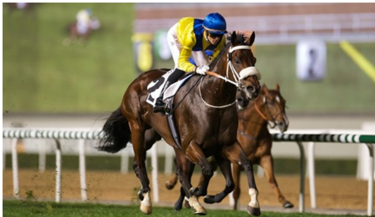
Vercingetorix