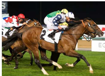
Ahtoug

AHTOUG (GB) (h, 7, Byron {GB} -- Cherokee Rose {Ire} {G1SW-Fr & Eng, $383,146}, by Dancing Brave ) opened last year's carnival with a victory over this track and trip, and his four subsequent starts resulted in three runner-up finishes sprinting down the straight, including behind the 2013 G1 Al Quoz Sprint winner