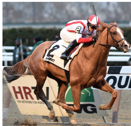
Leave the Light On

Gil Remsen S. winner Leave the Light On (Horse Greeley) has been taken off the Derby trail after sustaining an injury in a workout at the Palm Meadows training center over the weekend.