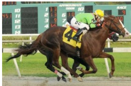
Catalina Red Tampa Bay Downs