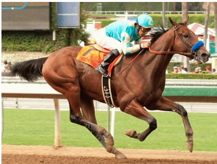
American Pharoah

The Jockey Club has released the 2014 Experimental Free Handicap, with both the colts' and fillies' divisions ending in dead heats. Among 2-year-old males, officials could not settle on a single winner as GI Breeders' Cup Juvenile hero Texas Red (Afleet Alex) and American