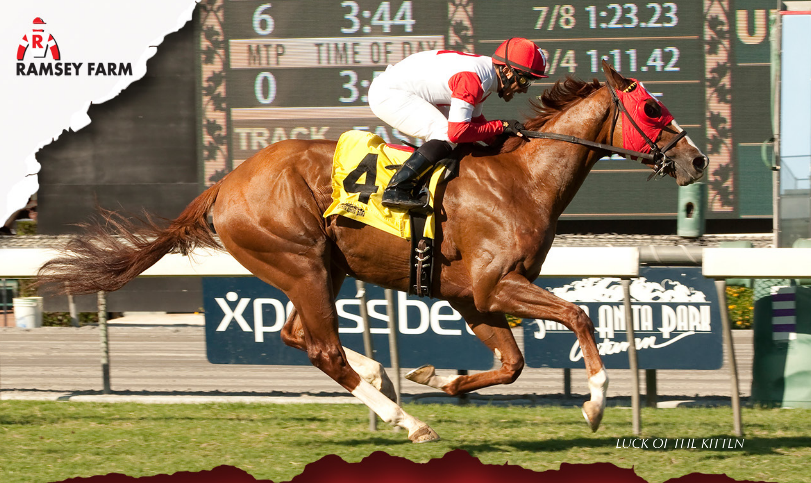
LUCK OF THE KITTEN