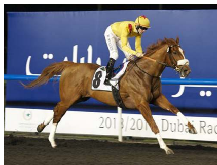
Surfer

Zabeel Racing International's Surfer (Distorted Humor) has gone two-for-two over Meydan's new dirt surface, including a maiden stakes score in the G2 Al Maktoum Challenge R1 last out Jan. 8, and the 6-year-old gelding will look to extend his streak to three in the G2 Al Maktoum Challenge R2 at Meydan today. Surfer has always been highly regarded by the team of trainer