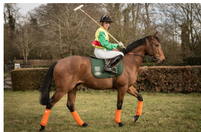
A racehorse and jockey ready for polo GBRI

Great British Racing International has partnered with British Polo Day in an extension of its efforts to bring overseas investment to the British racing and breeding industries. British Polo Day is a global network of exclusive, invite-only polo events, creating a platform to showcase British luxury goods in 10 international markets.