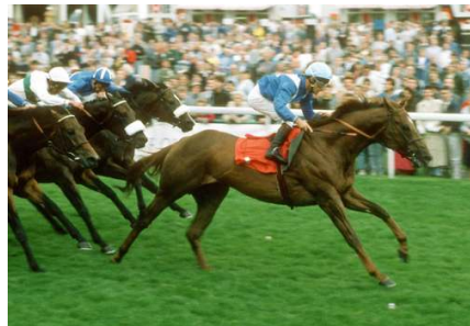
Cadeaux Genereux winning the William Hill Sprint Championship in 1989