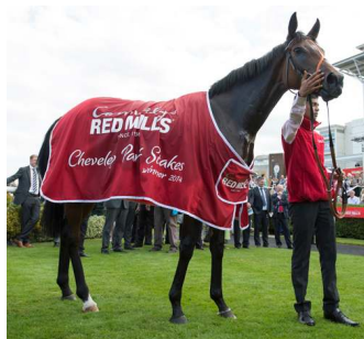
Group 1 winner Tiggy Wiggy is out of a mare bought at Tatts February Racing Post

The Tattersalls 2015 sale calendar gets underway today with the one-day February Sale at Park Paddocks in Newmarket. A total of 307 horses have been catalogued for the mixed sale, including more than 60 lots from Darley and its various trainers. Among the standouts under the Darley banner are the 3-year-old filly Elle Shade (GB) (Shamardal) from the yard of John Gosden. Offered as lot 143 , Elle Shade is an unraced daughter of Group 1 winner Elle Danzig (Ger) (Roi Danzig), and therefore a full-sister to multiple German Group 3 winner Elle Shadow (Ire) and a half to stakes winners El Comodin (Ire) (Monsun {Ger}) and Elle Gala (Ire) (Galileo {Ire}).