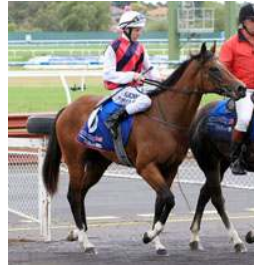
Burnstone