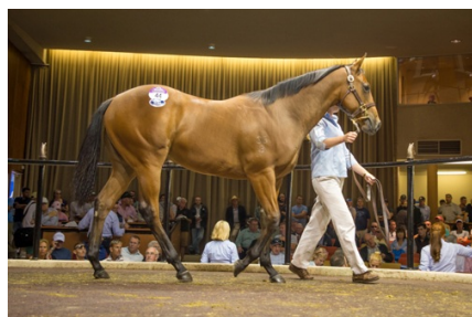
Session-topping Snitzel filly Inglis

The Inglis Premier Yearling Sale got underway with the first of four sessions yesterday in Melbourne, Australia. Gains were realized in high price, gross, average and median, and competition for local Victorian buyers was intense, with much countrywide and international interest. At the end of the day's trade, 112 yearlings had changed hands for A$10,581,000,