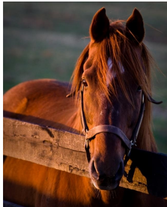
Creator

French Group 1 winner Creator (GB) (Mill Reef--Chalon {Ire}, by Habitat) passed away Saturday at the Rood & Riddle Equine Hospital due to complications from colic. He was 29. Creator had been pensioned at Old Friends Thoroughbred Retirement Farm since 2004.