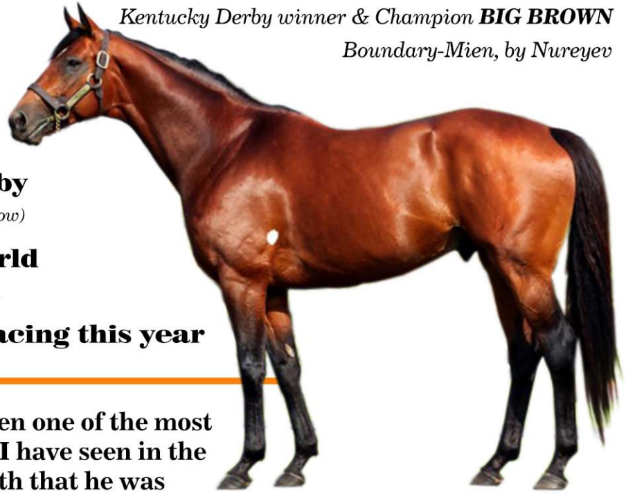
Kentucky Derby winner & Champion BIG BROWN Boundary-Mien, by Nureyev