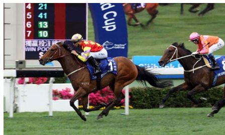
Designs on Rome

In 2007, Vengeance of Rain (NZ) (Zabeel {NZ}) registered a breakthrough success for Hong Kong, scoring in the G1 Dubai Sheema Classic. The strapping galloper won the Hong Kong Derby, the G1 Queen Elizabeth II Cup and G1 Hong Kong Cup all in calendar year 2005 and retired in 2008 as one of the true legends of the Hong Kong turf. Designs on Rome (Ire)