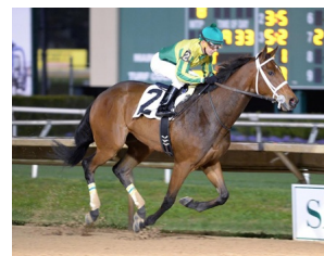
A Day in Paradise

surface Oct. 22, finishing behind Eagle (Candy Ride {Arg}) and My Johnny Be Good (Colonel John). Recently second behind MGSP War Story (Northern Afleet) in a one-mile optional claimer at the Fair Grounds Dec. 28, the gelding was bet down to heavy favoritism for this stakes try. The bay set the early pace along the rail before briefly