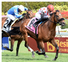
Souper Colossal Gulfstream photo