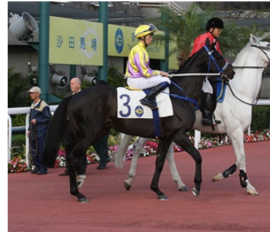
Renaissance Art HKJC.com

Renaissance Art , c, 4, More Than Ready --Lady Siphonica, by Siphon (Brz). Sha Tin, 3-1, Hcp. ($137k), 1600mT, 1:35.47. B-Lucy Bassett (KY). *$25,000 yrl '12 KEESEP. **Produced by a full-sister to 2001 GI Hollywood Futurity winner Siphonic, Renaissance Art