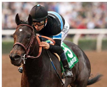
Shared Belief

Leading older horse Shared Belief (Candy Ride {Arg}) will face as many as 12 rivals in today's $1-million GI Santa Anita H. as he bids for a third-straight victory. The 2013 champion juvenile was an emphatic winner of the GII Los Alamitos Derby last July, and added the GI Pacific Classic S.