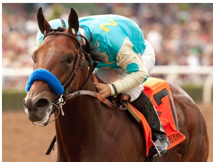
American Pharoah

Champion American Pharoah (Pioneerof The Nile), last seen annexing the GI FrontRunner S. at Santa Anita Sept. 27, breezed a bullet six furlongs in 1:10 2/5