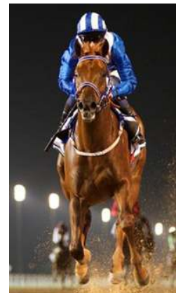
Tamarkuz

Sheikh Hamdan Al Maktoum's Tamarkuz (Speightstown) is likely to be sent out a hot favorite in the international pools, having won his last two outings by a combined 8 1/2 lengths. The 5-year-old never lacked ability--he has now been victorious in five of his 11 starts--yet a dislike of the starting stalls long proved a hindrance, which reached its peak when the entire unseated his rider in the first strides last March. This phobia showed again on his seasonal bow, when Tamarkuz lost several lengths jumping out before picking up to secure second place in a seven-furlong handicap Jan. 8. But on both his starts since, the horse left his antics behind him and was able to display his full potential. His latest effort in the G3 Firebreak S. was particularly impressive, and the mount of Paul Hanagan will again enjoy the benefit of a rail draw this time.