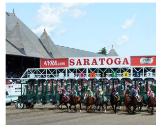
They're Off at Saratoga

An economic report issued Friday put the track's importance in perspective, showing that the 2014 season generated $237 million in economic activity and produced nearly 2,600 jobs. The economic activity was up nine percent and jobs were up 32% from the most recent survey in 2011.