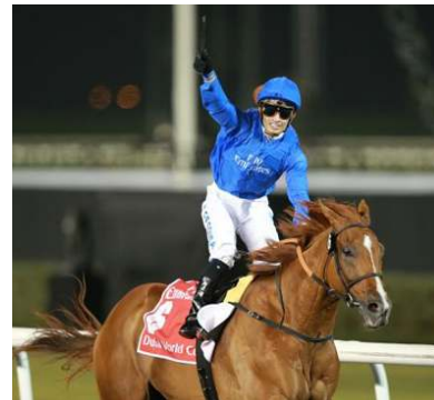
African Story