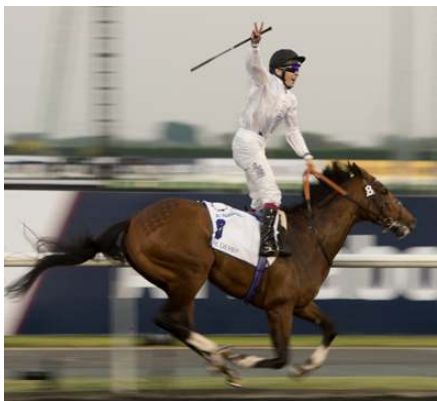
Toast Of New York Racing Post