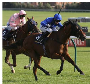
Sky Hunter Racing Post

Godolphin has two runners in the 10-strong field, headed by Sky Hunter (GB) (Motivator {GB}). The lightly raced 5-year-old finished first past the post in his last two outings, although he was disqualified from his Listed victory at Ayr Sept. 20 for testing positive to a banned substance. He hasn't been seen since romping nine lengths clear in the G3 St Simon S. at Newbury Oct. 21. This was his second win in as many attempts at the Classic trip, so stamina is clearly not an issue.