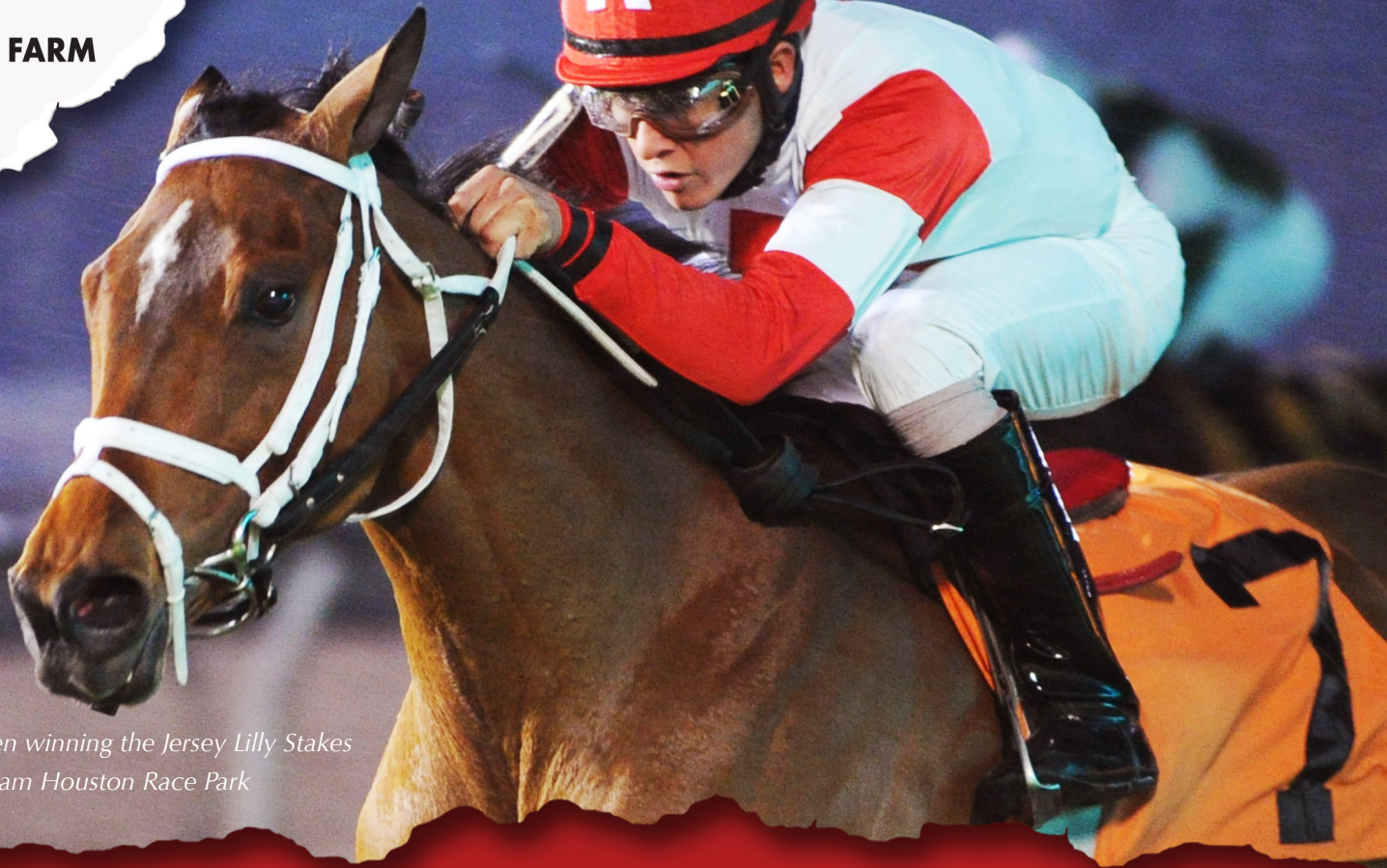
Kitten's Queen winning the Jersey Lilly Stakes at Sam Houston Race Park