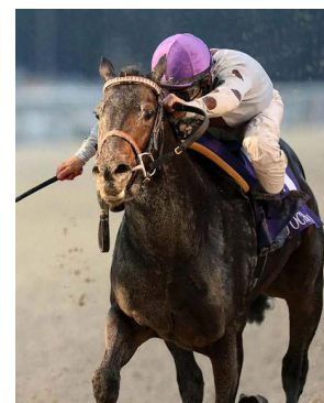
Ocho Ocho Ocho