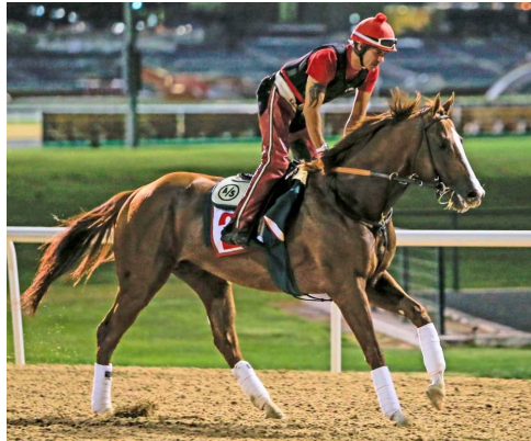
California Chrome

Emerging from dark shadows into the golden beams cast by overhead lights, California Chrome (Lucky Pulpit) strode on to the track at Meydan Racecourse in Dubai more than an hour before dawn on Mar. 23 looking like a Hollywood star who owned the vast racing theater built by Sheikh Mohammed.