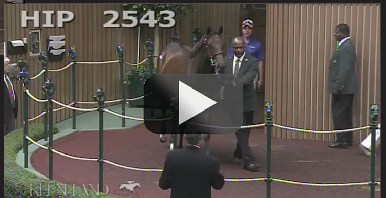
Bob Feld Hip 2543 purchased at Keeneland Sept. 2014