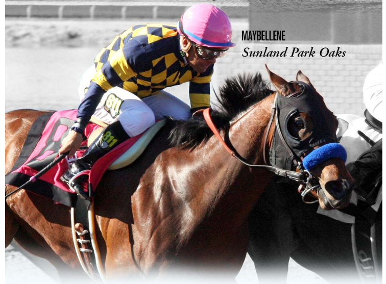
MAYBELLENE Sunland Park Oaks