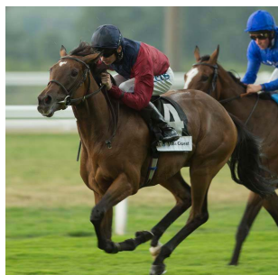
Malabar