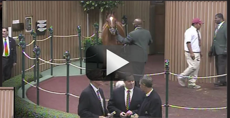
Nick de Meric Hip 1807 purchased at Keeneland Sept. 2014