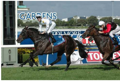
Vancouver Racing and Sports

'TDN Rising Star' Vancouver (Aus) (Medaglia d'Oro), recent winner of the G1 Golden Slipper S., will head to the paddock for a spell, skipping the remaining Triple Crown races. Instead, the colt will be aimed towards the G1 Caulfield Guineas and the G1 Cox Plate next year.