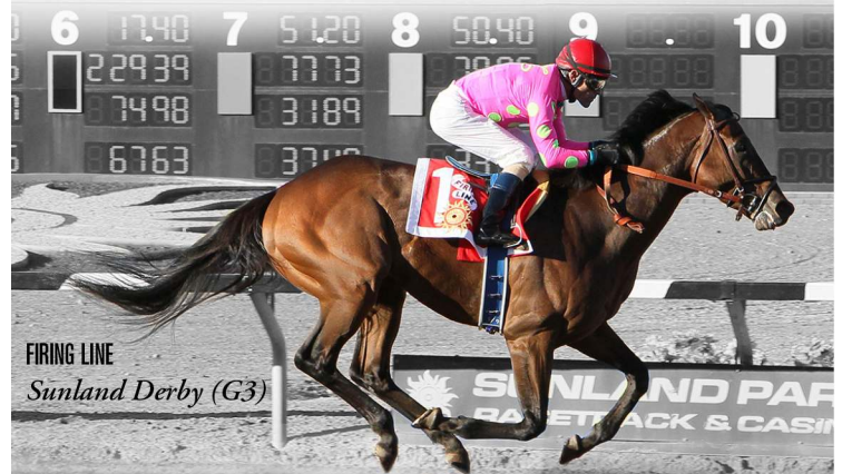
FIRING LINE Sunland Derby (G3)

KEENELAND GRADUATES DOMINATE DERBY & OAKS TRAIL