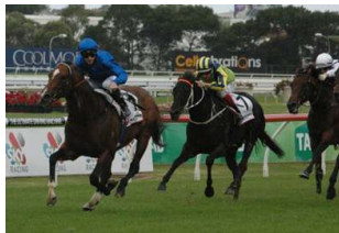
Contributer