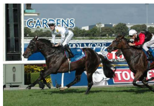
Vancouver Racing and Sports