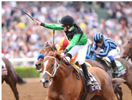
Work All Week

Champion sprinter Work All Week (City Zip) put in his first official work since his victory in the Nov. 1 GI Breeders' Cup Sprint Wednesday morning at Oaklawn. The chestnut breezed a half-mile in :48.20 with splits of :12.20, :24.20 and :36 for three furlongs, and galloped out five furlongs in 1:02.40.