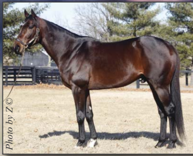
Made 18 starts, winning 7, earning over $300,000 ...