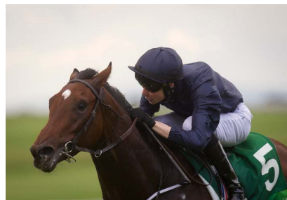
OI' Man River Racing Post