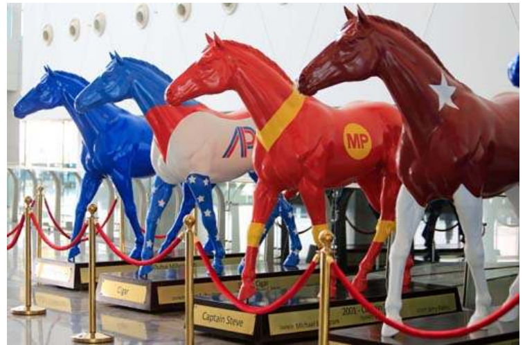
Dubai World Cup commemorative statues on display at Meydan, representing Dubai World Cup winners (l to r) Dubai Millennium, Cigar, Captain Steve and Singspiel

8-year-old, owned by Qatar's Pearl Bloodstock, with an eye shield and half-cut blinkers for his first career start on dirt.