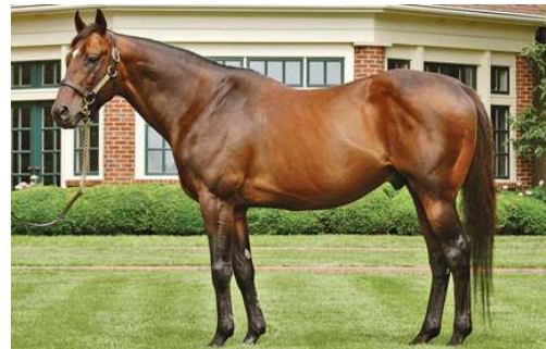
Smart Strike (1992-2015) Lane's End Farm