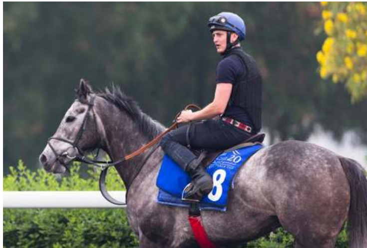
Dark Emerald before training Tuesday