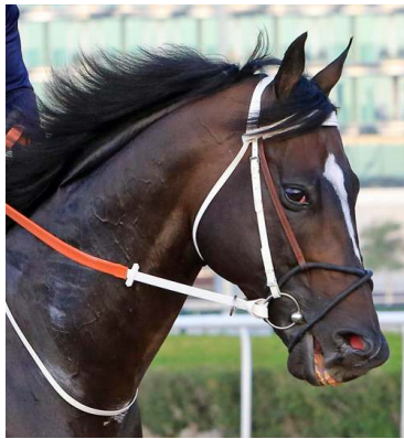
Prayer For Relief