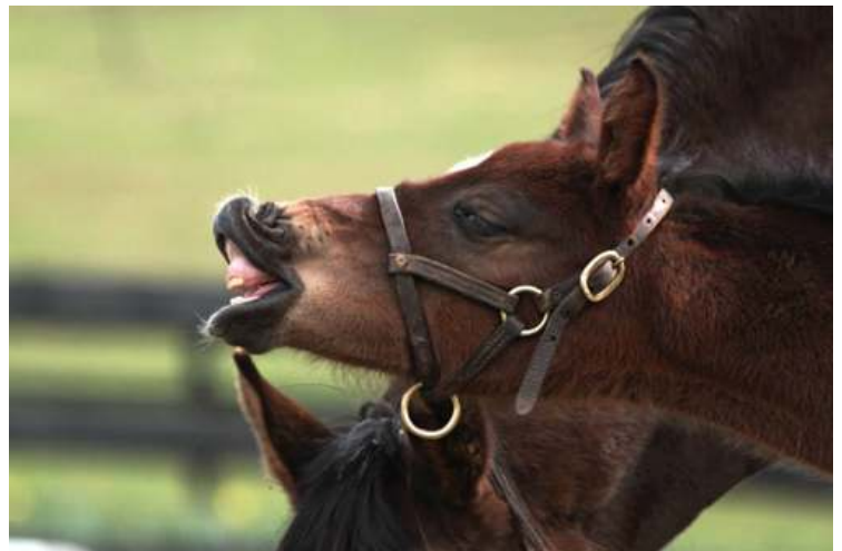
A Medaglia d'Oro--Wasted Tears filly born recently at Stonehaven Steadings in Versailles, KY.