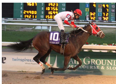
International Star