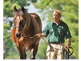
Lane's End Farm

Smart Strike entered stud in 1997 at Lane's End. From 56 named foals in his first crop, 10 were stakes winners, including Japan Cup Dirt winner Fleetstreet Dancer and MGSW Tenpins. Soaring Free hit the scene in 2002, and was given the Sovereign award for champion sprinter in 2003 and followed up the next year with Canadian champion turf horse and Canadian Horse of the Year.