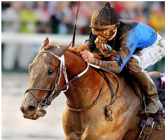
Two-time Horse of the Year Curlin