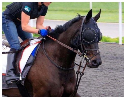
Side Glance sports his new headgear

British-based runners, who first cleared quarantine the previous day, seemed more relaxed on their second day of training at Meydan.