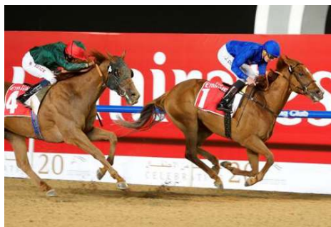
Defending winner African Story and stablemate Prince Bishop