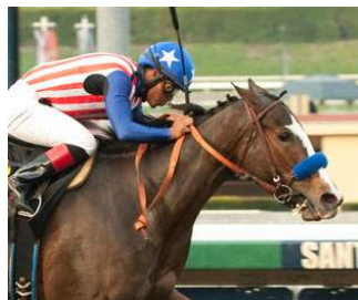
Fantastic Style

West Coast invader Fantastic Style (Harlan's Holiday) headlines a loaded renewal of Keeneland's seven-furlong GII Adena Springs Beaumont S. Sunday. A decisive winner at second asking in Arcadia Jan. 19,