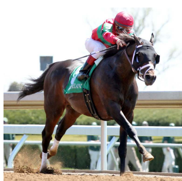
Protonico