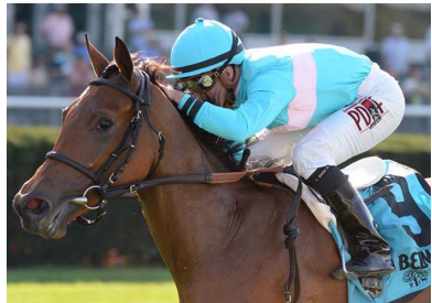
Lady Eli