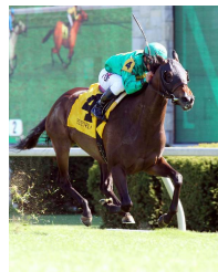
Ball Dancing