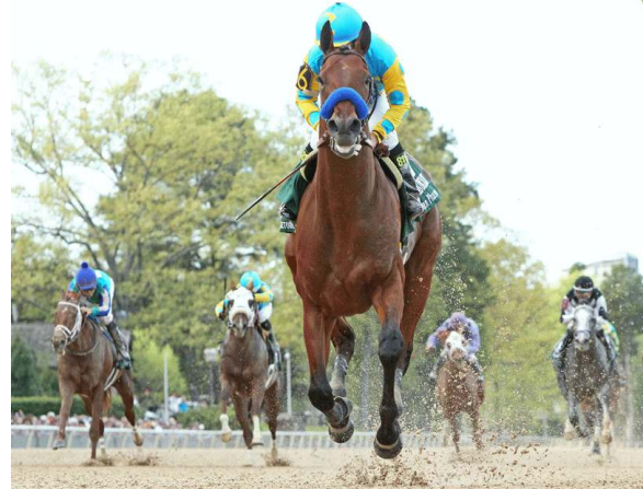
American Pharoah