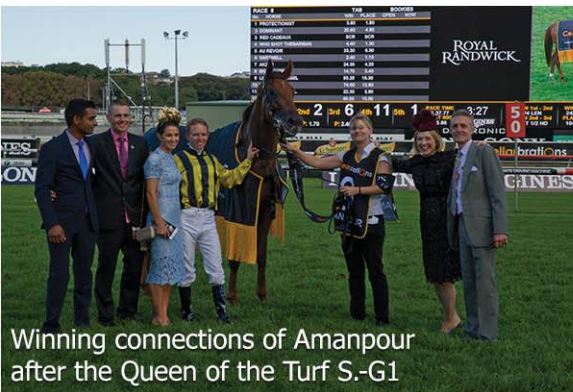
Winning connections of Amanpour after the Queen of the Turf S.-G1