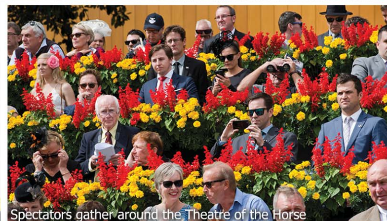
Spectators gather around the Theatre of the Horse