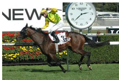
Gust Of Wind