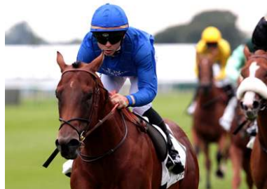
Territories Scoop Dyga