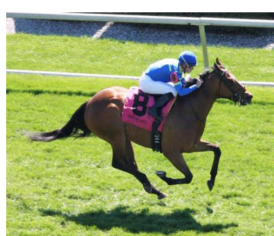
Katie's Eyes