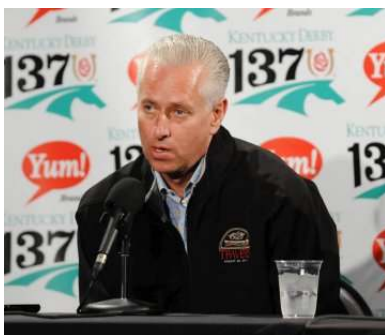
Todd Pletcher

Materiality, Itsaknockout and Stanford will continue to train in South Florida and will record one more breeze at Palm Beach Downs before heading to Kentucky Tuesday, Apr. 21.