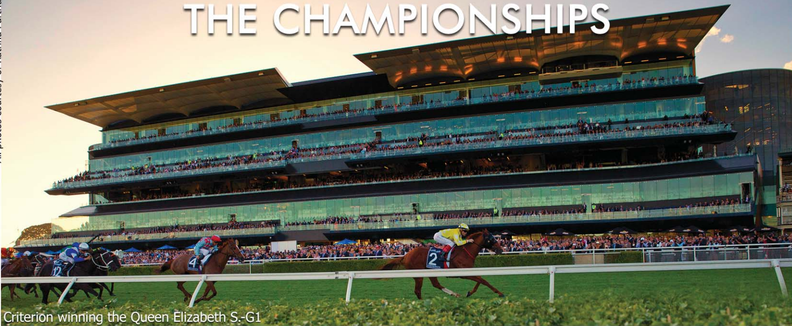
Criterion winning the Queen Elizabeth S.-G1