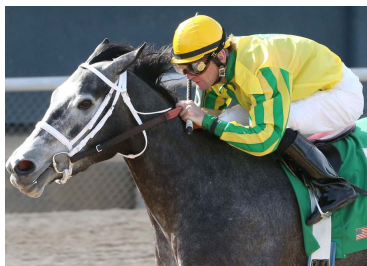
Promise Me Silver

Undefeated Promise Me Silver put in another powerful performance to collect her seventh straight victory in style. A 6 3/4-length debut winner at Lone Star May 11, she captured Churchill Downs's Debutante S. next out June 21 and romped by 7 1/2 in the restricted Texas Stallion S. at Retama Park Nov. 15. Closing out her juvenile campaign with a dominant win in Fair Grounds's Letellier Memorial S. Dec. 20, the gray earned a narrow victory over eventual GIII Honeybee S. winner Sarah Sis (Sharp Humor) in this venue's Dixie Belle S. Jan. 15. Romping by 9 3/4 lengths last time in Sam Houston's seven-panel restricted Two Altazano S. Feb. 14, Promise Me Silver broke alertly, but was quickly overtaken and forced to settle for a five-wide fifth through a sharp opening quarter in :21.75.