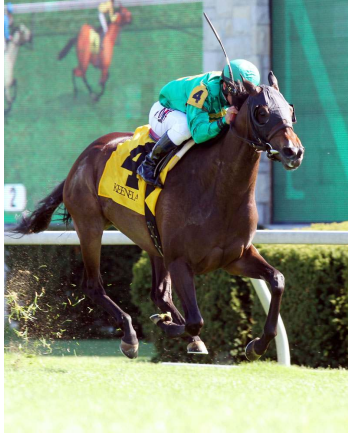
Ball Dancing