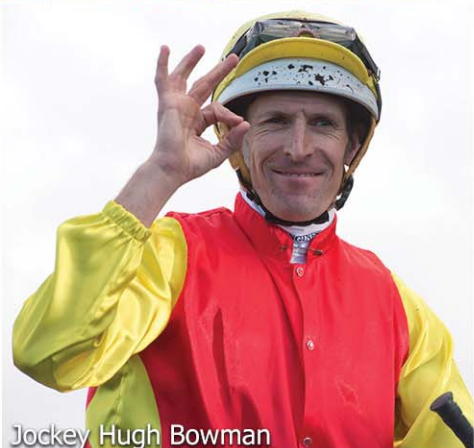
Jockey Hugh Bowman