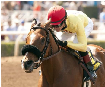
Masochistic