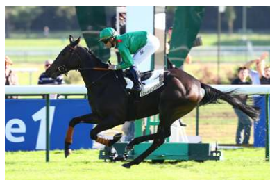
Vedouma Scoop Dyga

On a day of informative Classic trials, the European flat season bursts into life with Longchamp's G3 Prix de la Grotte, the showcase for fillies with pretensions to glory in the upcoming G1 Poule d'Essai des Pouliches.