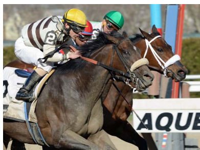
House Rules

House Rules had to work much harder than expected, but nonetheless got the job done as the heavy favorite. She was forwardly placed in fourth while saving ground