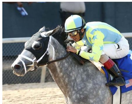
Race Day

The owner saw an immediate return on his investment, as Race Day dominated a one-mile optional claimer at Gulfstream Park Dec. 21, earning a