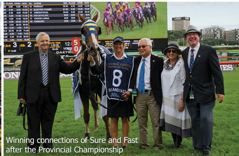
Winning connections of Sure and Fast after the Provincial Championship