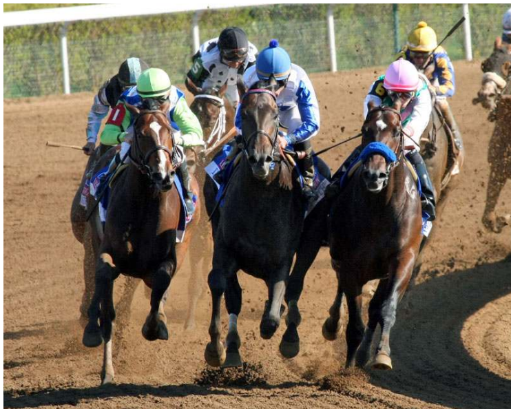
Divining Rod (left) goes for home in the Coolmore Lexington

The gate-to-wire winner of his one-mile debut rained off the Laurel turf Nov. 21, Divining Rod was an alibi-free third in his first allowance test over the Tampa turf course Dec. 26. Let go at 28-1 with a return to the main track for the GIII Sam F. Davis S. Jan. 31, he dueled on an easy pace and took them deep into the final furlong before succumbing to the late run from Ocean Knight (Curlin). Similar front-running tactics were attempted when Divining Rod was last seen in the GII Tampa Bay Derby, but he had to go much harder on the engine on that occasion and was no match late for 'TDN Rising Star' Carpe Diem (Giant's Causeway), finishing a tired third.