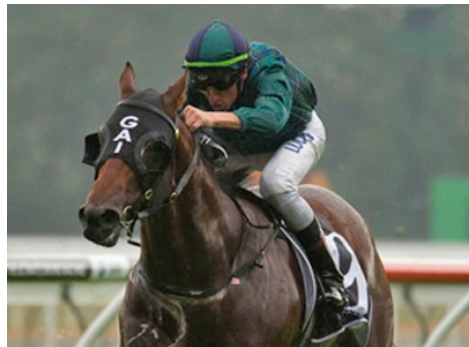
Wandjina Racing and Sports

G1 Australian Guineas scorer Wandjina (Aus) (Snitzel {Aus}) will target the G1 Diamond Jubilee S. at Royal Ascot before retiring to Newgate Stud later this year. The Gai Waterhouse-trained 3-year-old finished second to Dissident (Aus) (Sebring {Aus}), who will also enter stud at Newgate in September, in Saturday's G1 All Aged S.