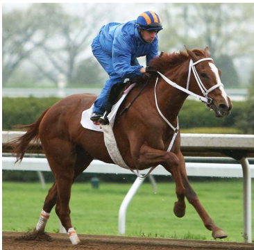
I'm a Chatterbox