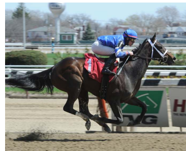
Mrs. Hudson

Mrs. Hudson, favored as part of a coupled entry with fellow first-time starter Delay of Game (Bernardini), rated patiently against the fence in fourth as Speightsfire (Speightstown) showed the way through a half in :46.94. The 4-5 co-favorite began to make headway on the far bend, but was trapped behind a wall of horses turning into the lane. Swung off the rail