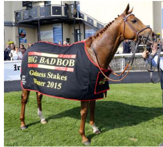
Flight Risk Racing Post

The chestnut managed a fourth placing on both occasions to provide some justification for his trainer's high regard. After being allowed to tackle maiden company on his fifth outing, he managed a workmanlike win over an extended mile at Cork in October and appeared to be exposed when ninth in the Listed Knockaire S. over this trip at Leopardstown later that month, as well as on his return when sixth in the six-furlong Listed Cork S. Apr. 6. Settled in mid-division early, the homebred produced his closing effort up the rail and, after gaining the lead passing the furlong pole, engaged his stamina.