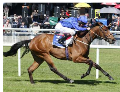
Mimicking Racing Post

1st-CGH, €16,500, Mdn, 2yo, 5fT, 1:04.37, yl. + MIMICKING (IRE) (f, 2, Invincible Spirit {Ire} --Her Own Kind {Jpn}, by Dubai Millennium {GB}) was on edge during the preliminaries, but exhibited a professional attitude stalking the pace trapped wide in a close fifth through the early stages of this first go. Coaxed to the front approaching the final furlong, the 2-1 favorite was ridden out in the closing stages to