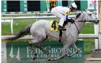
Shook Up