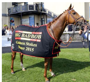
Flight Risk