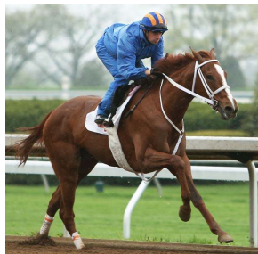
I'm a Chatterbox