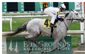
Shook Up