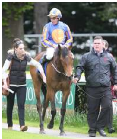
Kissed By Angels Racing Post

Kissed by Angels, who like Wednesday's Listed Cheshire Oaks winner Diamondsandrubies (Ire) (Fastnet Rock {Aus}) is out of a former Group 1-winning luminary trained at Ballydoyle, showed