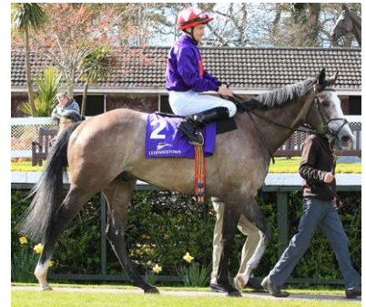
Success Days Racing Post

over the same course and distance. With his form boosted by the subsequent win of the Ballysax runner-up Zafilani (Ire) (Azamour {Ire}), the grey--who is on course for the June 27 G1 Irish Derby at The Curragh--faced a much easier task than looked likely earlier in the week with Ballydoyle's Order of