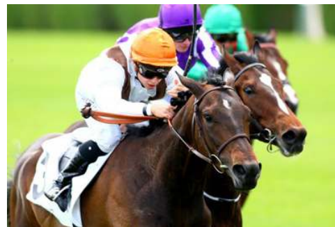
Ampere

Having looked a colt with a bright future when surging to a 2 1/2-length success in a conditions race over this course and distance Apr. 9, Ampere returned to provide Andre Fabre with an eighth renewal of this Derby trial. Whether the homebred is another Hurricane Run (Ire), who annexed this contest in his third start, remains to be seen, and he has a long way to go to match that criteria on the basis of this performance, but