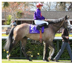
Success Days Racing Post