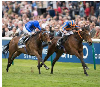
Legatissimo Winning at Newmarket