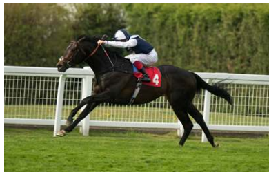
Jack Hobbs

Godolphin has joined the partnership that owns G2 Dante S. runner-up Jack Hobbs (GB) (Halling {GB}). The John Gosden-trained colt will race in the Godolphin silks and is a leading fancy for the G1 Epsom Derby June 6. Prior to his Dante second to stablemate Golden Horn (Ire) (Cape Cross {Ire}) at York May 14, Jack Hobbs won his first two trips to the post at Wolverhampton last December and a