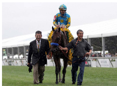
American Pharoah following his Preakness romp

"Whatever happens in the Belmont, American Pharoah is an outstanding sire prospect and we're very grateful to the Zayat family for entrusting us with his