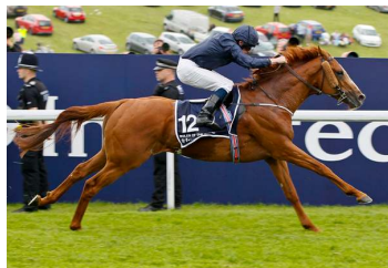
Ruler of the World Coolmore Stud

Coolmore partners and Al Shaqab Racing's 2013 G1 Epsom Derby hero Ruler of the World (Ire) (Galileo {Ire}) will miss the remainder of the 2015 breeding season after suffering an injury in the breeding shed this past weekend Coolmore announced Wednesday. A winner of the G2 Qatar Prix Foy and G3 Chester Vase S. in addition to his Derby triumph, the 5-year-old should be completely recovered to resume covering duties for next year's breeding season said the veterinarians at Coolmore.