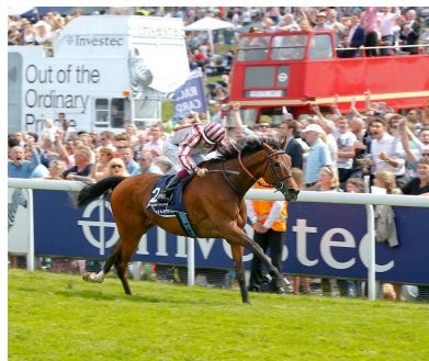
Cirrus Des Aigles winning the Coronation Cup in 2014

Tapestry (Ire) (Galileo {Ire}) looks set to be the sole Ballydoyle representative in the G1 Coronation Cup on Epsom Derby day June 6. Trainer Aidan O'Brien has already won the middle distance contest seven times and relies on the 4-year-old filly, who last year lowered the colors of Taghrooda (GB) (Sea the Stars {Ire}) in the G1 Yorkshire Oaks before running unplaced behind Treve (Fr) (Motivator {GB}) in the G1 Prix de l'Arc de Triomphe at Longchamp in October. A quality field of colts and geldings will also be in the mix with a strong Gallic challenge headed by Flintshire (GB) (Dansili {GB})