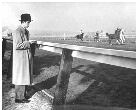
A.G. Vanderbilt at Belmont Park in 1940

The London-born and Massachusetts-raised Vanderbilt assumed control of his mother's 600-acre farm—named Sagamore—in Glyndon, Maryland, at the age of 21 in 1933, registered his silks and scooped up a horse he would name Discovery for $25,000. It was the beginning of a rich seven decades in the business. While still in his 20s, Vanderbilt purchased and took over the