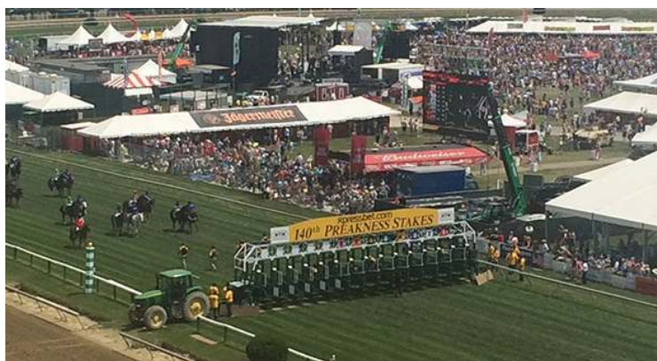
Infield crowds and the Preakness contenders: never the twain shall meet?