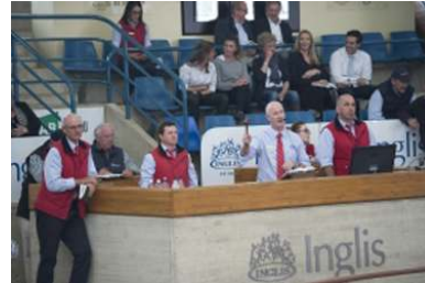
Inglis Sales Complex Inglis