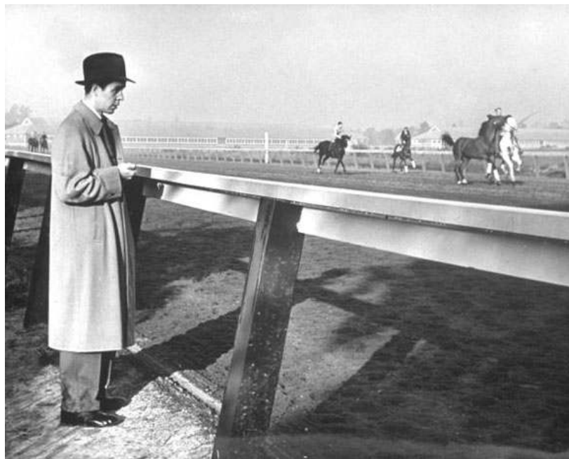
A.G. Vanderbilt (pictured) and John H. Whitney will enter Racing's Hall of Fame as Pillars of the Turf. Story p6