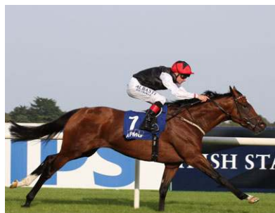
Free Eagle